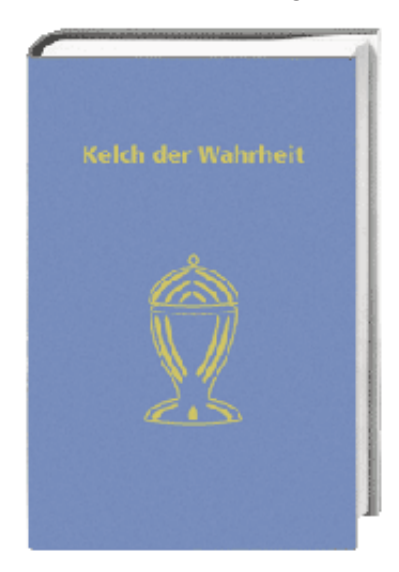
Goblet of the Truth The book of the entire Teaching of the Prophets

WE ARE CURRENTLY SEEKING SPONSORS FOR THE FIRST GERMAN / ENGLISH EDITION FOR KELCH DER WAHRHEIT / GOBLET OF THE TRUTH