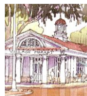
Howell Town Center, Michigan