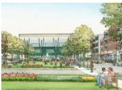
Troy Town Center, Troy, Michigan