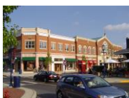
Easton Town Center, Columbus, Ohio