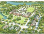
Three Rivers, MI