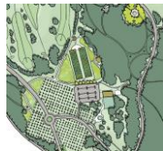
Palmer Park, Detroit, MI