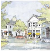
Village of Interlochen, Michigan