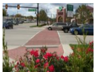
Oak Park, Michigan