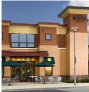
Middleton Hills, Wisconsin