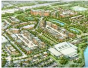
Troy Town Center, Troy, MI