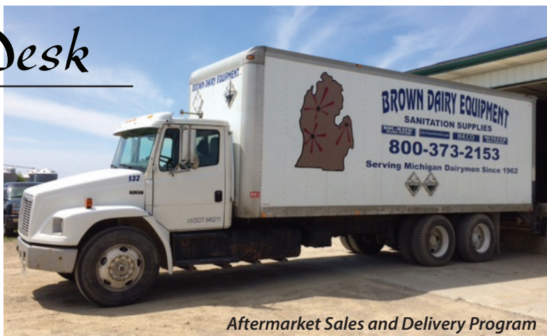
Aftermarket Sales and Delivery Program

We are highlighting our Aftermarket Sales and Delivery Team and Milk Quality Specialists. The route delivery team will deliver aftermarket products to your farm on a regular scheduled basis. We will check all your supplies so your dairy farm will not run out until the next scheduled delivery. Let us help to ensure your dairy operation has quality milk production and we can help with herd health management. Meet the team on page 2.