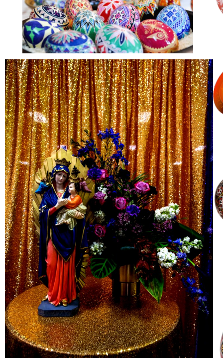
Our Lady of Perpetual Help