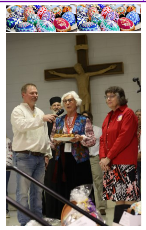
Kolach Ukrainian Welcome Bread