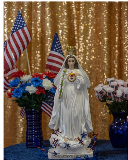
Our Lady of America