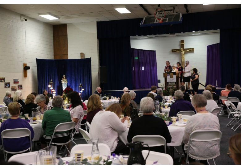
ROSARY Led by National Director and State Officers