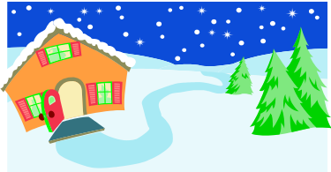
Fall into Winter