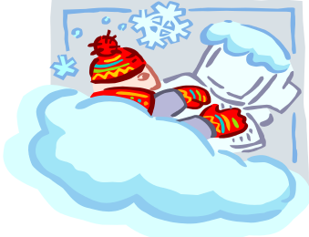
Let it snow