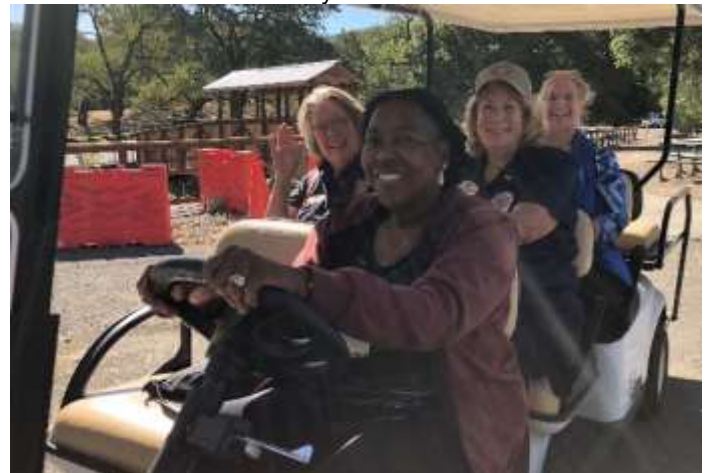
Names were not provided with the photograph.

Due to the Kincaid Fire we had to reschedule our Women Veterans Panel Discussion which was set for November 3rd. In November we participated in the Petaluma Veterans Day Parade and on December 7th will visit women veterans at the Yountville Veterans Home, and take gifts to them. Our holiday luncheon is set for December 14th at China Delight Restaurant in Rohnert Park.