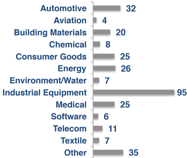
Projects by Industry