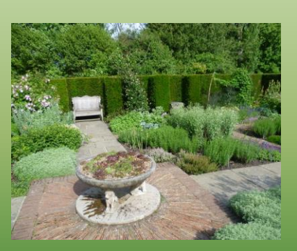
Visit the South Texas Unit Website for a <u>Monthly "To Do" List</u> !