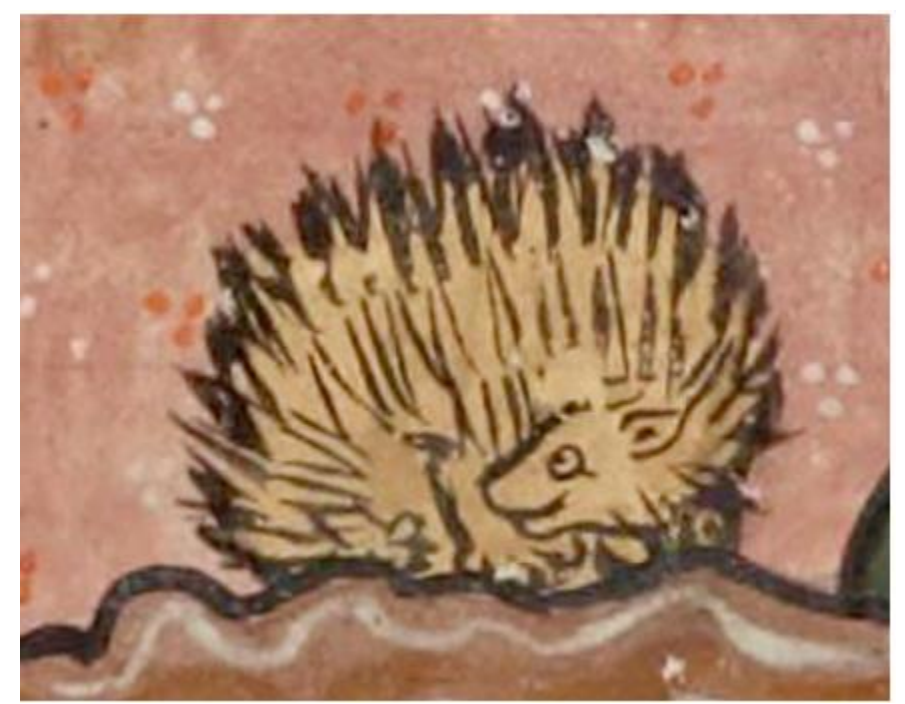
In Slavic mythology, the hedgehog is a chthonic animal with supernatural powers. Chthonic comes from "chthōn", which means "earth" in Greek

May we all "find the razkovniche" and be "forever happy and fortunate."