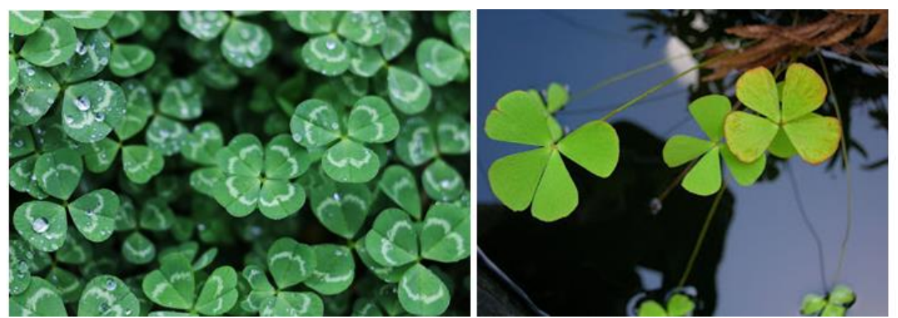
A closer look at the clover of Celtic folklore and the Slavic Razkovniche reveals two completely different plants. European water clover ( Marsilea quadrifolia ) on the right, compared with the more familiar Irish shamrock ( Trifolium repens ) on the left.

Varieties of Marsilea have been well established in the Northeastern United States for over 100 years and are popular plants for ponds and aquariums. Ironically, in some areas, the plant is considered invasive; in others, it is listed as endangered.