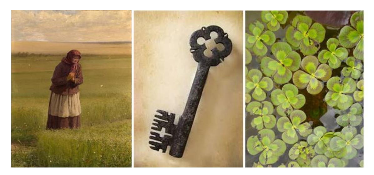
"Old Woman in the Field" by Vasily Maximov, 1891, next to a 13th -14th c. iron skeleton key. The "Magic Herb" on the right, is known as the "Earth Key" in Slavonia.

In one Serbian legend, for example, a merchant who wanted the herb for himself locked an old woman into leg irons. All night long she wandered in a field. Suddenly, the irons unlocked themselves, revealing the exact spot where the elusive Raskovnik grew. A clever merchant, I suppose, but a bit callous, don't you think?