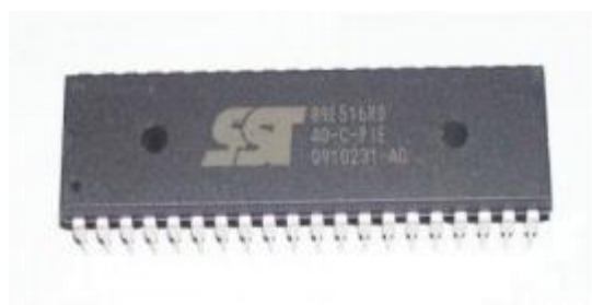
FIGURE 1: SST microcontroller.

One of the variant of 80C51 microcontroller is P89V51RD2[6] which has 1kB RAM and 64 kB flash. The memory of flash can be wiped out and written again as many times as needed. The capability to reprogram multiple times and its inexpensiveness is the reason for its use wide variety of applications. The combination of intelligent hardware and software makes this product ideal. The protocol sent through the serial port from the computer is understood by the boot loader inside the microcontroller. The hardware and the chip inserted is identified by the "Flash magic" which is a software on the computer side. The program in the format of Intel format HEX file is sent to the target microcontroller and also can be read back. The reading back of the programmed chip is prevented by locking of the devices. It can still be wiped and used for new loading the programs even after the chip is locked.