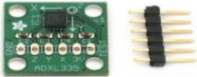
FIGURE 2: ADXL335 accelerometer

The ADXL335 [2][4] from the analog devices is the basis for first generation three-axis acceleration sensor board. Its wide areas of applications are movement ,slope and shock detection. The acceleration values are generated for the X-axis, Y-axis and Z-axis. The variation of voltage on few pins varies the sensitivity of the output. An analog to digital converter is needed to read the acceleration values since the output of MMA7260Q is analog.