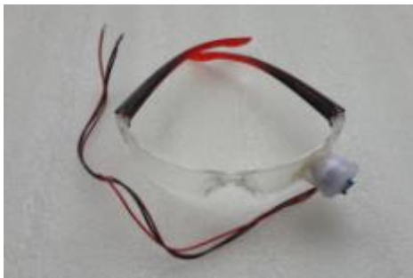
FIGURE 3: Wearable with eye blink sensor

The eye blink sensor [2] uses the phototransistor and differentiator circuit to monitor the changes in the light reflected from the eye and eyelid area by illuminating the IR rays. Emitter-detector positioning and aiming with respect to the eye, determines the exact functionality of the eye blink sensor.