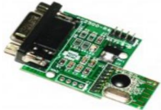
FIGURE 4: Zigbee transceiver

Xbee modules are famous for their simplicity in the usage. They are ready to be operated out of the box. There are simple AT commands and APIs for the advanced custom configurations.