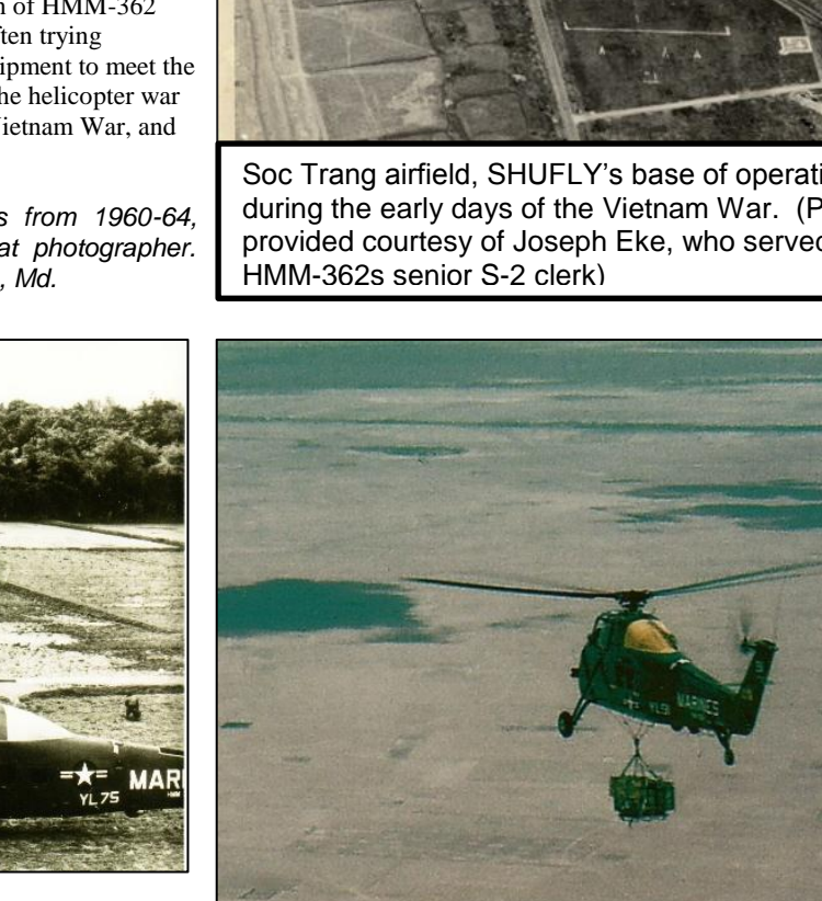
One of HMM-362s helicopters, with supplies slung beneath, flies from the USS Princeton into the Soc Trang airbase on April 15, 1962.