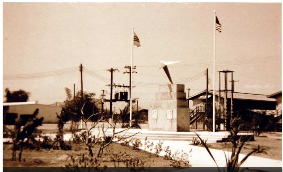
Early Attempt to honor Vietnam Veterans. Memorial to the last American to die in Southeast Asia before the ceasefire. Da Nang, March 1973.

The History and Education Branch continues to develop a variety of educational materials and programs as we ramp up to the 50<sup>th</sup> Anniversary of the Vietnam War Commemoration and we are receiving immense support and assistance from a variety of recognized academic institutions and production companies.