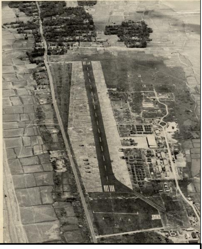
Soc Trang airfield, SHUFLY's base of operations during the early days of the Vietnam War. (Photo provided courtesy of Joseph Eke, who served as