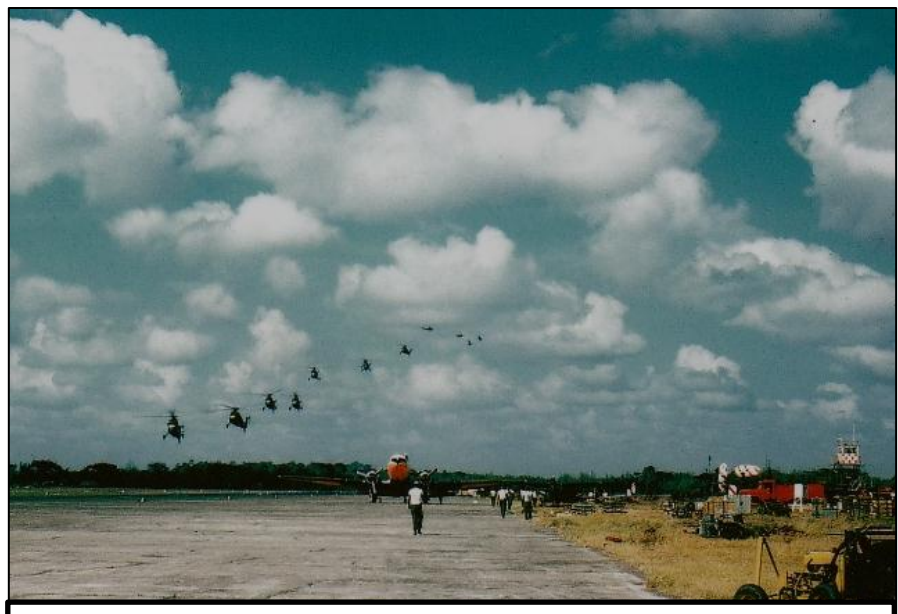
HMM-362 returns to the Soc Trang airbase following a mission during its 1962 deployment to Vietnam.