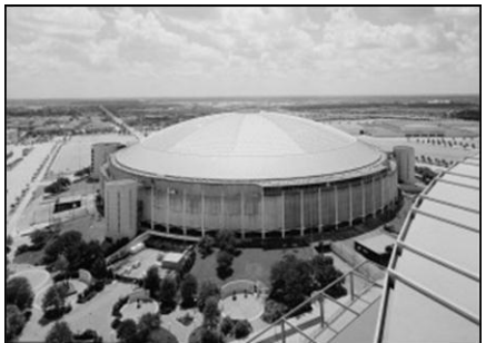
The newly completed Houston Astrodome.