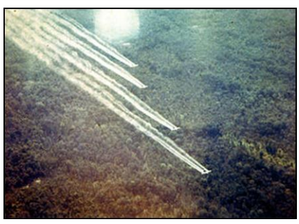
13 January: U.S. begins herbicide spraying in Vietnam

Some will argue that the US became officially involved when MAAG-I assumed responsibility for training South Vietnamese on 12 February 1955, while others suggest