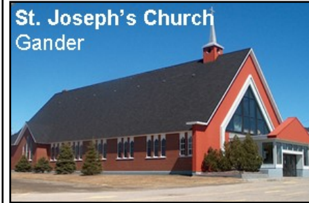
St. Joseph's Church Gander