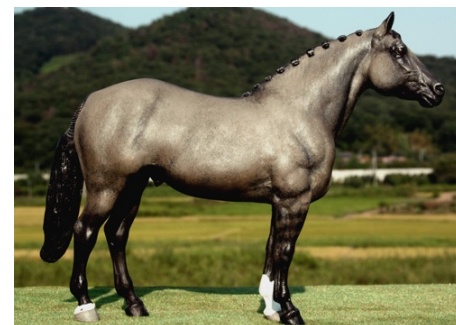
RES. CHAMPION REPAINT/HAIR OR SCULPTED M/T: TADEUSZ (AC)

Simple Remake & Repaint w/Hair M/T: Trad. or Larger (9): 1-Milwaukee City (SSu), 2-Hollywood Jaguar (SSu), 3-Te- jas Little Eagle (CM), 4-Chief's Jersey Squire (SSu), 5-Diamond Red Hawk (CM), 6-Cutter's Pokey Pine (CM), 7-Polaris (SSt), 8-Nhi Vanye I Chyya (LoB), 9-Sum- mer Breeze (SSu)