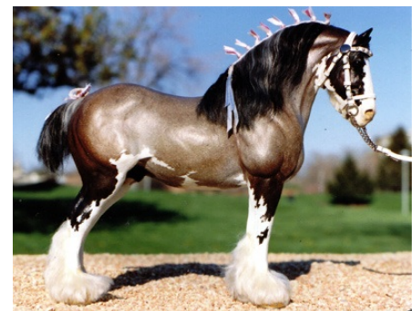
RESERVE CHAMPION PATTERNED COLOR: THUNDER IN PARADISE (AC)

Longear/Exotic (12): 1-Belle Kabong (AC), 2-Imagine That (ShR), 3-J's Tiger Lily (AI), 4-J's Dandyllion (AI), 5-So Molson Canadian (SSu), 6-Sweet Adelaide (CV), 7-Gentleman John (BH), 8-O Karen (CV), 9-Pammule-a (KW), 10-Gallimaufry (SSu), HMs-Ironwood Glenn (SSt), Bob (SSu)