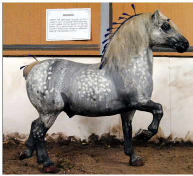
RES. CHAMPION DRAFT BREED: KING DEVEROUX (SSu)

American Pony (7): 1-Wrang Bo Deedy (AC), 2-Black Hand (CV), 3-Diamond Playtime (CM), 4-Jokers Dice (AC), 5-Lady Jessica (CV), 6-Lady Red Diamond (AP), 7-Brookridge Danton (CV)