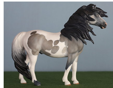
RES. CHAMPION MAJOR REMAKE/REPAINT/HAIR OR SCULPTED MANE/TAIL: SHANE (KO)