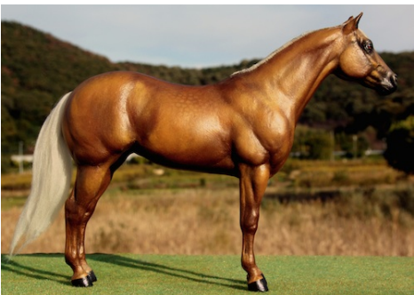
RESERVE CHAMPION STOCK BREED: GOLDEN MALICIOUS (SM)

Arabian (84): 1-Asuka Ryo (AC), 2-Hathor (SN), 3-Vijelie Noptii (BR), 4-RAS Shiraz (KW), 5-RAS Khatifa (CM), 6-Hakuryuu (CV), 7-Bint Amira (CV), 8-Coronation (KO), 9-Moonlight Cocktail (CV), 10-Mistress Nine (CV), HMs-Maamoon Azeem (SH), Ghanissa Em (CH)