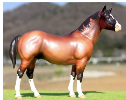
RESERVE CHAMPION REPAINT: JET-STREAM JOE (AC)

Repaint with Hair M/T: Trad. or Larger (89): 1-Megazone Eve (AC), 2-Sadamebi-us (AC), 3-The Midnight Flasher MB (CM), 4-TS Elegant Gypsy (MP), 5-Mon'Nafa Rani (CR), 6-Stupefyn' Jones (CM), 7-Iron Butterfly (AC), 8-Classy Chassis (SSu), 9-Fantasy Charisma (SSt), 10-Lalique (LoB), HMs-TS Vesuvius (MP), Tasha (KO)