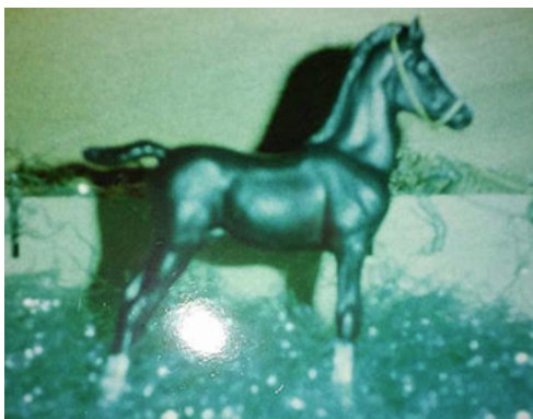
Light Breeds (1): 1-Bint Layla (KW)

Sport & Spanish & Draft & Pony & Longear/ Exotic/Fantasy Breeds : no entries