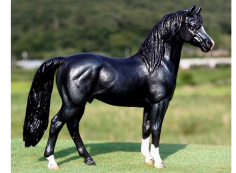
HORSE: SUMMER OF NIGHT (AC)

Longear (23): 1-Jeb (SSu), 2-Rhubarb Babe (AC), 3-Slightly Scarlett (HC), 4-Rebel Yell (RN), 5-Sunshine's Beebop (CV), 6-Fancy Feather Too (AC), 7-De-meter (SSu), 8-Churchy LaFemme (AC), 9-MN Elwood Blues (RN), 10-Alter Ego (ShR), HMs-CZ Ambrose (JC), Shamrock Elfin Magic (SSu)