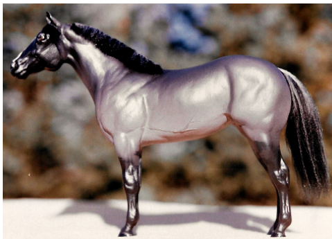
Mares (10): 1-Lonesome Dove (CM), 2-Wahaana (SN), 3-DQ Shiaway Jetta (CM), 4-Ar Tayet (SN), 5-Sun's Only For You (SN), 6-Lady Glade (IC), 7-Nayef (SN), 8-The Iron Madam (IC), 9-Sherwood Peacock (CM), 10-Romanadvoratrelundar (SSu)