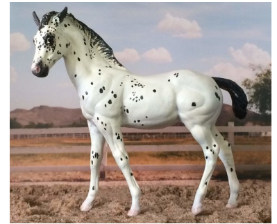
RES. CHAMPION FOAL: NORTHERN LAD (ShR)

1960s/'70s BREED DIV. OVERALL CHAMP: WICKENDEN OSPREY (AC)