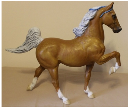
RESERVE CHAMPION GAITED BREED: CARNIVAL KING (LB)