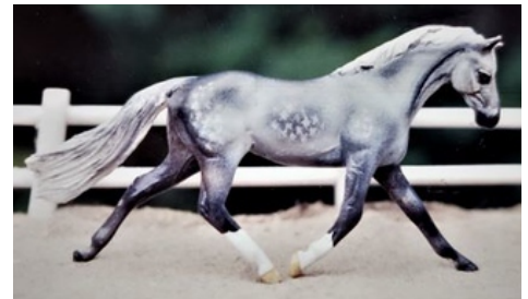
CHAMP SPORT BREED: ANISE (BR)

Other Pure or Mixed Sport Breed (12): 1-Heartlight (HC), 2-Tug Hill By Design (CM), 3-Outlasting The Blues (AC), 4-The Mad Cookie (CV), 5-Cherokee Rose (JV), 6-Sunshine's Hardcore Chocolate (AC), 7-Blank Stare (ShR), 8-DQ Konoc-ti's Jet (CV), 9-Blood Music (CV), 10-Jersey Boots (BP), HMs-Bag Lady (LK), TS Fire On The Mountain (MP)