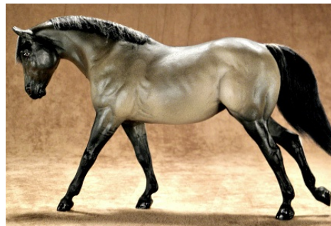
CHAMPION CREAM/DUN COLOR: MISS SMOKUM ROYAL (CM)

Dun/Grulla (14): 1-Miss Smokum Royal (CM), 2-No Doubt (CV), 3-Althea (ShR), 4-Such Are Promises (AC), 5-Zona Lee (AC), 6-Jetstream Joe (AC), 7-Mito's Something Wicked (SSu), 8-Kid's Spanish Cash (CM), 9-My Sweet William J (AI), 10-Seven S Rebel (LoB), HMs-Confederate Gray (LoB), Desert Medallion (RN)