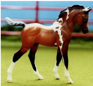
RESERVE CHAMPION CUSTOM WITH FACTORY PAINT: FAIRUZA (AP)

Repaint: Traditional or Larger (41): 1-Asuka Ryo (AC), 2-Sparkling Chablis Z (CM), 3-Brimstone (JC), 4-Breezen (AI), 5-November Rain (BR), 6-*Komment (SSt), 7-Harlock (AC), 8-Jedi Moon (AI), 9-Spy Games (JC), 10-Poco Skybar (RN), HMs-Kentucky Bugaboo (SSu), Racing the Sun (BP)