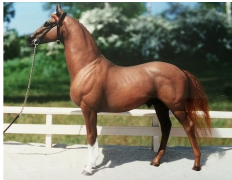
Stallions (7): 1-Sun's Oh Connor (SN), 2-Ar Sayyed (SN), 3-Space Cowboy (SSu), 4-Gold Dust (CC), 5-Florentine (SSu), 6-Scimitar's Ebony Flame (CM), 7-Ebony & Ivory (CM)