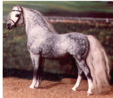
CHAMPION PONY/MINIATURE HORSE: WICKENDEN OSPREY (AC)

Miniature Horse and Other Pure or Mixed Pony Breed: no entries