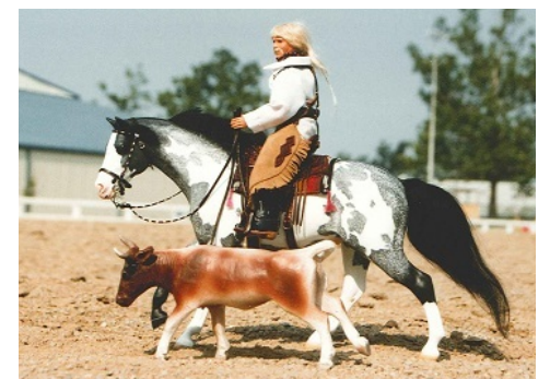
Scenes: Digital & 35mm Photo (8): 1-Bluegrass Freckles: Cow Work, 2-Alamitos Ridge: Ride with Jace (RN), 3-Whippoorwill Incognito (BR), 4-LBR Kybele: Visiting Marbach (RN), 5-Regina Kashmir (BR), 6-LBR The Pinkeyed Stallion: Winter Prairie (RN), 7-LBR The Pinkeyed Stallion: Frozen Prairie (RN), 8-Carousel (HC)