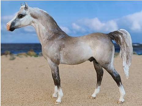
CHAMPION SIMPLE REMAKE/REPAINT/HAIR OR SCULPTED MANE/TAIL: WBP FROSTYBITES (LeB)

Simple Remake & Repaint with Non-Hair M/T: Smaller than Classic (10): 1-WBP FrostyBites (LeB), 2-Skip Mount (RN), 3-Meghan's Hope (SSSt), 4-ZI Jedi Jetta (AI), 5-Ziggy (HC), 6-Shales Sassy Miss (IC), 7-Star At Rest (AI), 8-Ice Queen (AI), 9-McQueen (LK), 10-Marlayna (ShR)