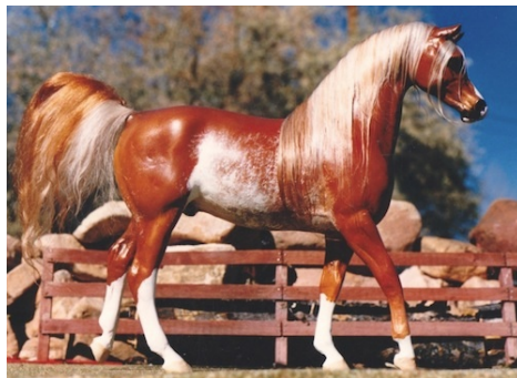
CHAMPION OTHER COLOR: MOON-CRAFTER (CV)

Fantasy Color (5): 1-Rheanth (AC), 2-The Scepter (AC), 3-Aquarion (AC), 4-Phantom F Harlock (CV), 5-Carousel (HC)