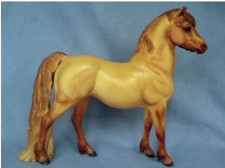
RESERVE CHAMPION LIGHT BREED: ROB ROY (KW)

Thoroughbred (43): 1-Indian Pride (KO), 2-Master Derby (AC), 3-Brimstone (JC), 4-Half A Shadow (SN), 5-WBP Surprise Package (LeB), 6-Temple Lord (SN), 7-Sunset Romance (KO), 8-Claudia (SN), 9-Elegy (AI), 10-Katana (SN), HMs-In The Dark (ShR), Iron Eagle (SSSt)