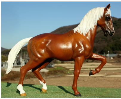
Tennessee Walking Horse (1): 1-Merry Mountain Mist (APo)