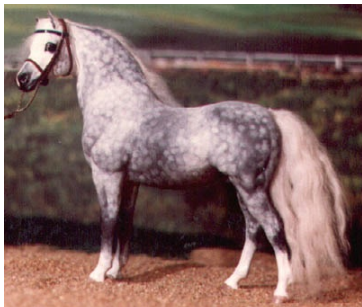
CHAMPION MAJOR REMAKE/REPAINT/HAIR OR SCULPTED MANE/ TAIL: WICKENDEN OSPREY (AC)

Major Remake & Repaint w/Non-Hair M/T: Classic and Smaller than Classic: no entries