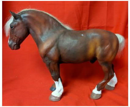
EBay, August 2021: Iowa seller closetcol-60's Breyer Roy CM by unknown artist circa early 1990s, auctioned to unknown buyer for $65.00.