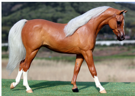
CHAMPION LIGHT BREED: GOLDWILLOW (AC)

Other Pure or Mixed Light Breeds (8): 1-Sadamebius (AC), 2-Wendell Gee (KO), 3-Dancing Image (KO), 4-Non-Stop Holiday (LaD), 5-Skartaris (CH), 6-*Moonblade (SSu), 7-Rastaman (BP), 8-The Flying Dun (CM)