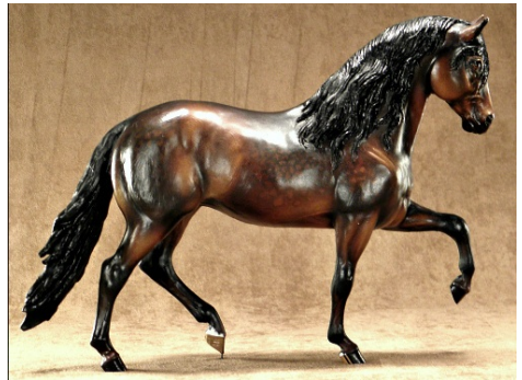
CHAMPION SPANISH BREED: MARQUESA (CM)

Other Pure or Mixed Spanish Breed (11): 1-Malegena (CM), 2-KT Danza De Oura (CM), 3-Siglavy Seiko (CV), 4-Evasive Vision (SSSt), 5-Encaje (SSSt), 6-Estela (VM), 7-RM Sophiiaa (CV), 8-TS Picante (MP), 9-Gateado Mancho (AC), 10-Ice Queen (AI), HM-PR Bosanova Brief Encounter (JV)