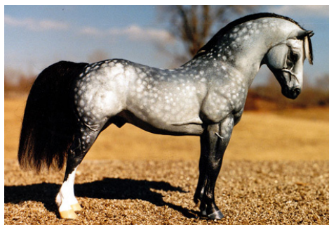
RES. CHAMPION EXTREME REMAKE/REPAINT/HAIR OR SCULPTED M/T: SOLDIER BLUE (AC)