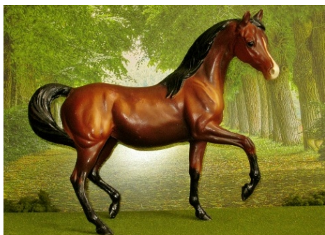
RES. CHAMP CUSTOM W/FACTORY PAINT: FIREO (NF)

Repaint: Trad. or Larger (22): 1-Follow The Moonlight (AC), 2-Al Dhabab al'Aswad