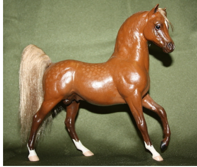
RESERVE CHAMPION SIMPLE REMAKE/REPAINT/HAIR OR SCULPTED MANE/ TAIL: AMROTH (CV)

Major Rem. & Rep. w/Hair M/T: Trad. or Larger (12): 1-Wickenden Osprey (AC), 2-Rocking Chair Renegade Revel (CM), 3-Indiana Jones (LoB), 4-Melulu (CV), 5-Brookridge Diamond (LoB), 6-Diamond Legacy (SSu), 7-Jokers Dice (AC), 8-Penny Arcade (BP), 9-High Chaparral (CV), 10-Telemann (LoB), HMs-*Quest (AC), Alconbury Starbringer (SSu)