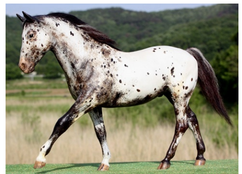
CHAMPION PATTERNED COLOR: SUNSHINE'S P.O. PLENTY (AC)

Other Pinto Patterns (88): 1-Thunder In Paradise (AC), 2-Bloodbath Highway (CV), 3-Chirin's Bell (AC), 4-Deloyer Jodevin (AC), 5-Janx Bluesinthenight (AC), 6-Targa Carrera (AC), 7-Splasha Red (CM), 8-Whispering Winds (AI), 9-Peppy Playboy (CS), 10-Dominion Blue Douglas (SSu), HMs-Alamance (EH), Alamitos Ridge (RN)