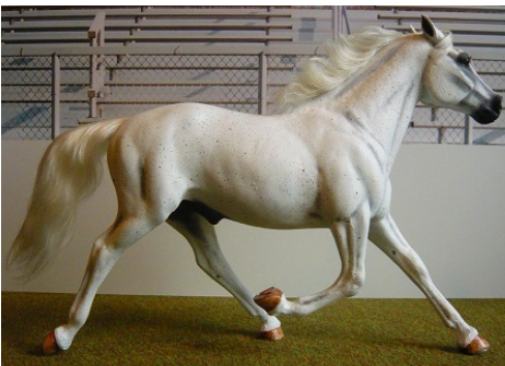
RES. CHAMPION SPORT BREED: PR MONSTELLA STORMING HOME (JV)

Paso Fino/Peruvian Paso (12): 1-Marquesa (CM), 2-Tesoro D Oro (JW), 3-LJ Abricotine Bleu (JV), 4-TS Jalapeno (MP), 5-TS Crystal Conchita (MP), 6-DO Caballo Del Sol (AC), 7-Me Bolido El Pastor (JW), 8-Huaricanga (KW), 9-TD Kalife's Dee Dee (HC), 10-Noche Estrallado (SSu), HMs-Lad Amigo (HC), PR Balenciaga Brio (JV)