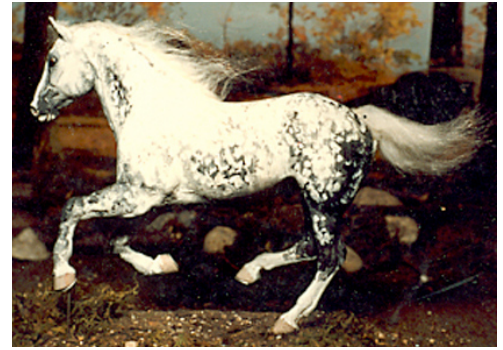
Death Star (SSu), 7-Do Wacka Do (SSu), 8-Duke Nukem (SSu), 9-F.O. Bolereau (SSu), 10-Witchita Rock (CM), HMs-Excel (JP), TS Chasing Rockets (JP)