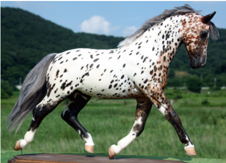
CHAMPION SPORT BREED: ROWRBAZL (AC)

Other Pure or Mix Sport Breeds (30): 1-Solid Citizen (CM), 2-PR Murphy Brown (JV), 3-PR Rosie O'Grady (JV), 4-The Bluesmobile (AC), 5-San Louie Obispo (AC), 6-Kamtara Colorado Autumn (JV), 7-PR Wharram Percy (JV), 8-Mickey Scymon (AC), 9-Mr Darcy (SN), 10-DO Mirabeau Costello (JV), HMs-PR Timberline Acoustic Blue (JV), Schneider (SSu)