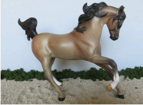
CHAMPION CUSTOM WITH FACTORY PAINT: GHANISSA EM (CH)

Retouch/Partial Paint Removal/Etch on Factory Paint w/Non-Factory Mane/ Tail and Remake and Retouch/Partial Paint Removal/Etch on Factory Paint w/Non-Factory Mane/Tail: none