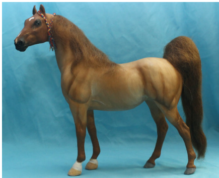
CHAMPION GREY/ROAN: DQ SPICY STEPPER (SSt)

Roan (32): 1-DQ Spicy Stepper (SSt), 2-Banned From Argo (AC), 3-Stupefyin' Jones (CM), 4-Go Varian (AC), 5-Justy (AC), 6-J's Sweetbriar (AI), 7-Blue Gale Bars (AC), 8-Hancock's Boondocs Blues (JV), 9-Sox And Violence (AC), 10-Miss Impressive Reno (IC), HMs-Stonor Eagle (EH), Trueno Azul (CM)