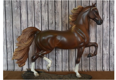
RES. CHAMPION REPAINT/HAIR OR SCULPTED MANE/TAIL: HIGH SOCIETY (KK)

Simple Remake & Repaint w/Hair M/T: Traditional or Larger (85): 1-Coronation (KO), 2-RM Two-Tone Starburst (CM), 3-Seonee Elegy (AC), 4-Maamoon Azeem (SH), 5-Ahvaz Wahaana (SN), 6-DO Go Wild (RN), 7-DO Miz Coppertone (RN), 8-PR Rosie O'Grady (JV), 9-Hollywood Gold (CF), 10-PR Murphy Brown (JV), HMs-TS Dragon Knight (MP), TS Dragon Warrior (MP)