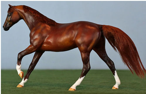
RES. CHAMPION SIMPLE REMAKE/REPAINT/HAIR OR SCULPTED MANE/TAIL: SUNSET ROMANCE (KO)

Major Remake & Repaint w/Hair M/T: Trad. or Larger (100): 1-Willie's Wyld Fire (RN), 2-Mars Flash (AC), 3-Crusher Joe (AC), 4-Hathor (SN), 5-RAS Shiraz (KW), 6-Kuato (IC), 7-RAS Elian Demoiselle (CM), 8-Bed Of Roses (RN), 9-Plastique (SSu), 10-DO November Day (RN), HMs-Herald Of Thunder (CH), Leviton (JP)