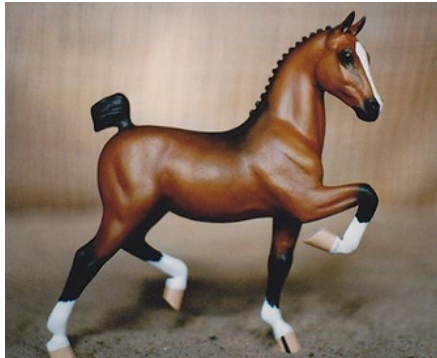
CHAMPION EXTREME REMAKE/REPAINT/HAIR OR SCULPTED M/T: CLOCKWORK (LaD)

Extreme Remake & Repaint with Non-Hair Mane/Tail: Smaller than Classic (5): 1-Anise (BR), 2-Queen's Gambit (JC), 3-Whippoorwill Drop Dead Fred (BR), 4-DQ April Whisper (SSu), 5-LL Tidal Wave (SM)