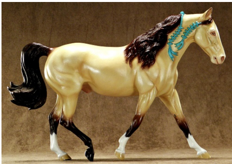
RESERVE CHAMPION GAITED BREED: SPARKLING CHABLIS Z (SM)

Clydesdale/Shire (18): 1-Deloyer Starblazer (AC), 2-Drambuie (BR), 3-TS Annie Red (MP), 4-RAS Elian Demoiselle (CM), 5-RM Nuclear Winter (KW), 6-Rumneyhill Victoria (SN), 7-TS Bonnie Red (MP), 8-Sparrowood Rob Roy (SSu), 9-So JS Trade-off (SuR), 10-KT Cracklin' Rosie (AC), HMs-PR Burning Blue Soul (JV), Deloyer Donald (AC)