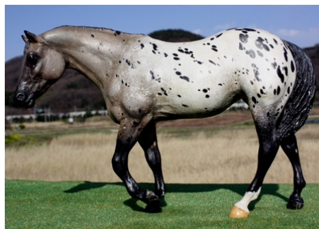
WATERS UNDER EARTH (CV)