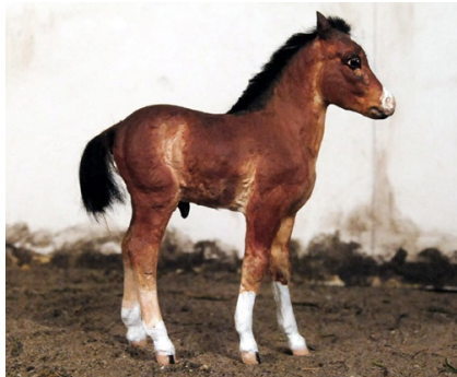
1990s COLOR DIVISION: NUMMY MUFFIN COCO BUTTER (SSu)