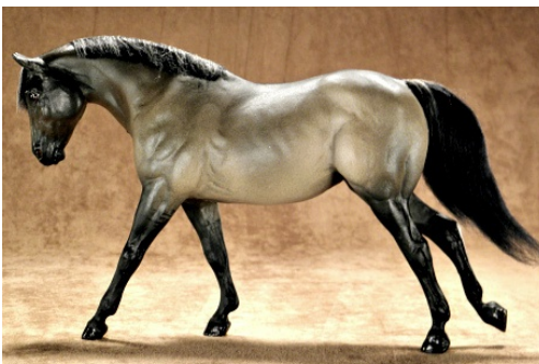
CHAMPION STOCK BREED: MISS SMOKUM ROYAL (CM)

Paso Fino/Peruvian Paso (8): 1-Tony Harken (AC), 2-Diamond Majestad (CM), 3-Encantador (CM), 4-Stephano (JW), 5-Danzante (AI), 6-Trueno Azul (CM), 7-Cancion De Amor (AP), 8-Reynarda (AC)