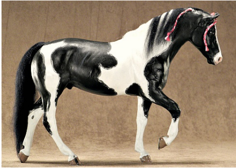
CHAMPION GAITED BREED: FENRIS SIR PRIZE (CM)

Three-Kay (AC), 3-Foxy Moonshine (CM), 4-TS Galilean Dragoness (MP), 5-Ima Travelin' Man (CM), 6-MN Lugalie (KK), 7-TS Autumn Nor'easter (MP), 8-Lighen Up Jack (HC), 9-Midnight's Mac (CV), 10-Hit The Switch (SSu), HMs-Thumbs Up (HC), PopRocket (HC)