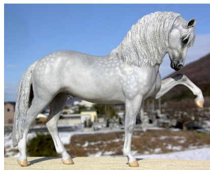
RESERVE CHAMPION REPAINT: FOLLOW THE MOONLIGHT (AC)

Repaint w/Hair M/T: Trad. or Larger (24): 1-Ibn Samekh (AP), 2-Plum Garden (AC), 3-Dane Tyler Bennington (LoB), 4- Paisano (NF), 5-Malika (SSt), 6-Cayenne's Cyette (SSu), 7-Milwaukee Rascal (SSu), 8-Lady Jessica (CV), 9-Bint Kareyma (SSt), 10-Lewisfield Latigo (AC), HMs-Minstrel's Joy (AP), Tex-Sun's Rosita (SSu)