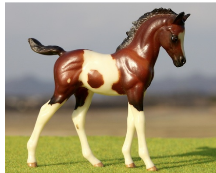
RES. CHAMPION CUSTOM W/FACTORY PAINT: STRATOKHASTER (CV)

Repaint: Trad. or Larger (55): 1-Arahael (LoB), 2-Azi (AP), 3-Hobo's Lullaby (AC), 4-Red Tribution (AC), 5-Such Are Promises (AC), 6-Oak's Dun Purrfect (CM), 7-Montana Cat (LoB), 8-Loftus Jones (LoB), 9-Zenith (LaD), 10-Heartbreaker (CH), HMs-Cedar Hill Duncan (VM), Love Letters (LoB)