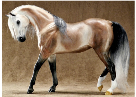
RES. CHAMPION SPANISH BREED: MALEGENA (CM)

American Saddlebred (21): 1-TS Missy Brown (MP), 2-High Society (KK), 3-Operation Meteor (AC), 4-All Eyes On Me (CV), 5-Sultan of Swing (JC), 6-TS Pleistocene (MP), 7-TS Autumn Dancer (MP), 8-TS Equinox (MP), 9-Highland's Captain Jack (NF), 10-Fancy Miss (JW), HMs-Morning Belle (SSSt), Fall Sunrise (HC)