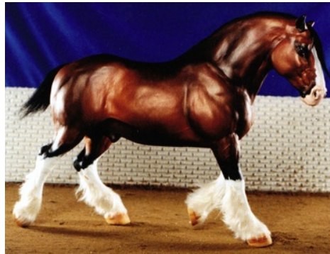
RES. CHAMPION DRAFT BREED: DELOYER STARBLAZER (AC)

American Pony (17): 1-Dark Naoto (AC), 2-Siri's Sly Delilah (AC), 3-Abayo Fly Bye (AC), 4-Kuato (IC), 5-Speed Trap (Al), 6-TS Sheldon (MP), 7-Harmon Irongear (CV), 8-LJ Abby Someone (CV), 9-Ambrosea (CM), 10-Space Cowboy (CV), HMs-RM Winkin' At The Moon (AC), DP Wreckless (JW)