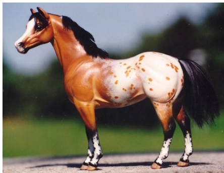
CHAMP MAJOR REMAKE/REPAINT/HAIR OR SCULPTED MANE/TAIL: SIRI'S SLY DELILAH (AC)

Major Remake & Repaint w/Non-Hair M/T: Smaller than Classic (13): 1-Vijelie Noptii (BR), 2-Moonlight Cocktail (CV), 3-Lykke (AC), 4-Strange Meadowlark (AC), 5-Northern Exposure (BR), 6-WBP Jolly Roger (LeB), 7-Knight of the Zodiac (CV), 8-In Lieu Of Cartier (BR), 9-Marshdale Gold Rust (AL), 10-Ridley (LK), HMs-Cast Iron Slew (AI), Majestic Ziggy (AL)