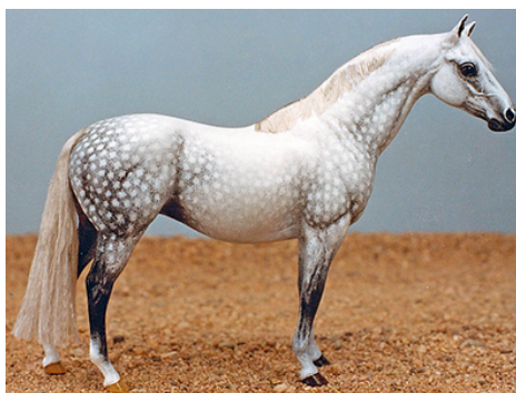
RESERVE CHAMPION GREY/ROAN: JETAN'S GLORY (KO)

Palomino (27): 1-SKS Aristo Khat (CM), 2-Goldwillow (AC), 3-Tony Harken (AC), 4-My Sputnik Baby (CV), 5-Diamond Sunseeker (ShR), 6-So Supremely Fancy (AI), 7-Delight's Gold Coin (AC), 8-Love Letters (LoB), 9-Ka Hank (ShR), 10-Casterly Rock (KW), HMs-Fiesta Jones (LoB), Millers Golden Boy (AL)