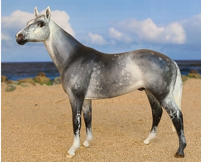
RESERVE CHAMPION REPAINT: WBP SURPRISE PACKAGE (LeB)

Repaint w/Hair M/T: Trad. or Larger (44): 1-Rio Grande (CS), 2-Golden Malicious (SM), 3-GGK Tiqatu (SN), 4-TS Squall Line (MP), 5-RumbleRex (SM), 6-PR Eldorado Spanish Rose (JV), 7-TS Picante (MP), 8-Impressive Lady (CS), 9-Cool Million (JW), 10-PR Prairie Fox (JP), HMs-TEA Sheeba (SN), GS Solitude (JW)