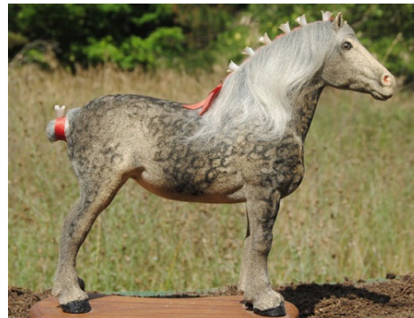
RES. CHAMPION FLOCKED/OTHER CUSTOM: COSETTE (SSu)

1980s WORKMANSHIP DIV. OVER-ALL CHAMP: FOX MAIDEN (AC)