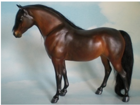
1990s BREED DIVISION: WAV BROWN BESS (LiD)