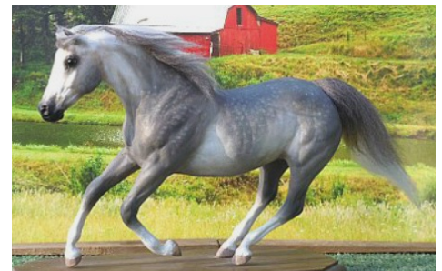
RES. CHAMPION SPORT: DIAMOND HANDSOME DEVIL (BH)

Paso Fino/Peruvian Paso (1): 1-Trigger Mortis (AC)