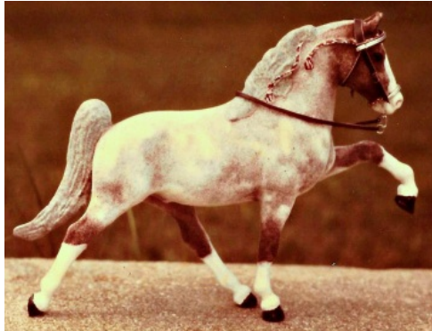
Gaited Breed (1): 1-Roaring Roan (CM) Gone But Not Forgotten: Vintage customs that no longer exist

Sport & Spanish & Draft & Pony & Longear/ Exotic/Fantasy Breeds : no entries