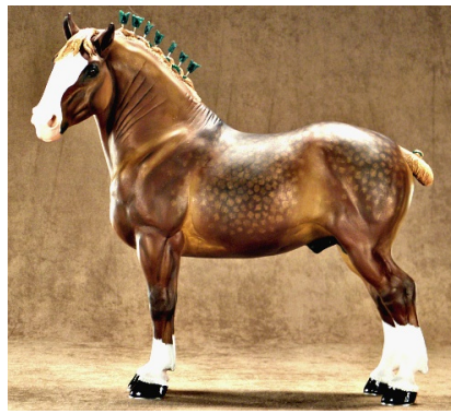
CHAMPION DRAFT BREED: LE COMTE DE MONTE CRISTO (CM)

Other Pure or Mixed Draft Breed (16): 1-DO Bessancour Moulin Rouge (JV), 2-TS Dragon Knight (MP), 3-TS Dragon Warrior (MP), 4-TS Druid Allanon (MP), 5-Die Rosenkavalier (JV), 6-Pippilotta-Elmar (JV), 7-Atragon (AC), 8-TS Lady Leeward Gem (MP), 9-So Farceur Sandman (KK), 10-Aytolis (LeB), HMs-KT Le Baron (CV), WBP Lean On Me (IC)