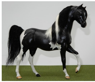
RES. CHAMPION MAJOR REMAKE/REPAINT/HAIR OR SCULPTED M/T: IBN GITANO (CV)

Extreme Rem. & Rep. w/Hair M/T: Trad. or Larger (15): 1-Diamond Handsome Devil (BH), 2-Rockledge Diamond Lark (CM), 3-Diamond Seonee (AC), 4-Kandu Koho (AC), 5-Diamond Flame (SSu), 6-Diamond Fancy Cat (CM), 7-SD Conversano Diamond (AP), 8-Brookridge Diamond II (AP), 9-Shales Commander (IC), 10-Merry Mountain Mist (AP), HMs-Battle-shoe Lori (AC), RM Bay Bandit (AP)