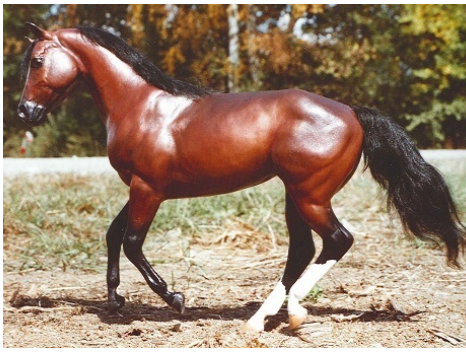
1980s WORKMANSHIP DIVISION: RHEINGOLD (RN)