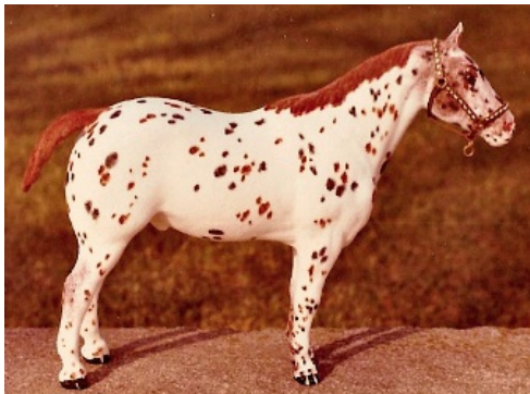
Stock Breeds (1): Kingpin Machado (CM)

Breed Classes: Photo formats other than 35mm or digital