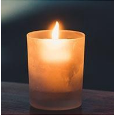
Charity Simmons 10/2020