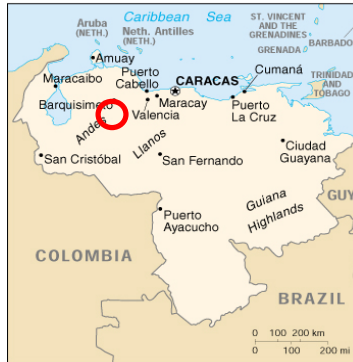
Map of Venezuela highlighting Sanare

In May 2006, two weeks after my first visit (see separate report) I returned to Sanare and Yacambú national park in Lara state. This latest report gives brief highlights of my activities in the area, plus an updated bird list that includes a merged listing of birds seen in the Yacambú area during the two trips.