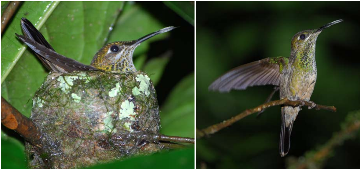
Violet-chested Hummingbirds (f) [endemic to Venezuela]

We also discovered a large and very vocal Lazuline Sabrewing in a relatively open patch of forest. Despite working with such a cooperative model, we jointly suffered in our attempts to get decent, naturally lit photos in the modest forest light. As the below examples show, using my external flash indeed delivers enough power to capture him in action - even at some considerable distance - but it also results in degradation of the stunning and subtly varying colours of his reflective feathers. I imagine this common hummingbird problem could be solved with multiple, off-camera flash heads giving more dispersed light sources? Amongst the many dozens of natural light shots that I took and then deleted (isn't digital great!) I did get a couple of decent ones, including a gorgeous tail fan during one stretching session.