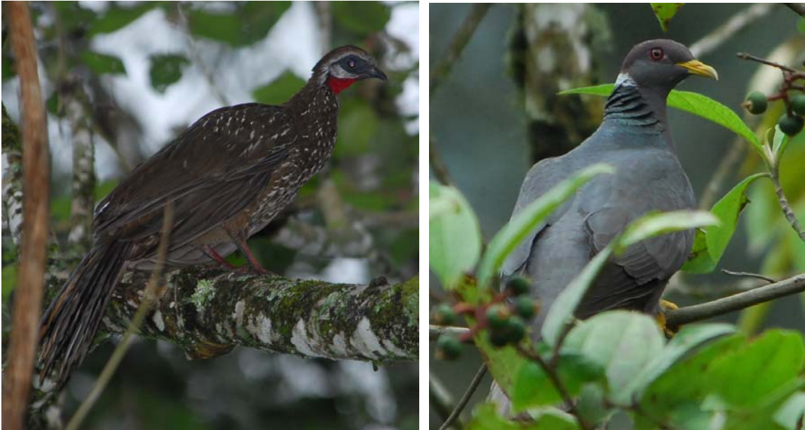
Band-tailed Guan; Band-tailed Pigeon