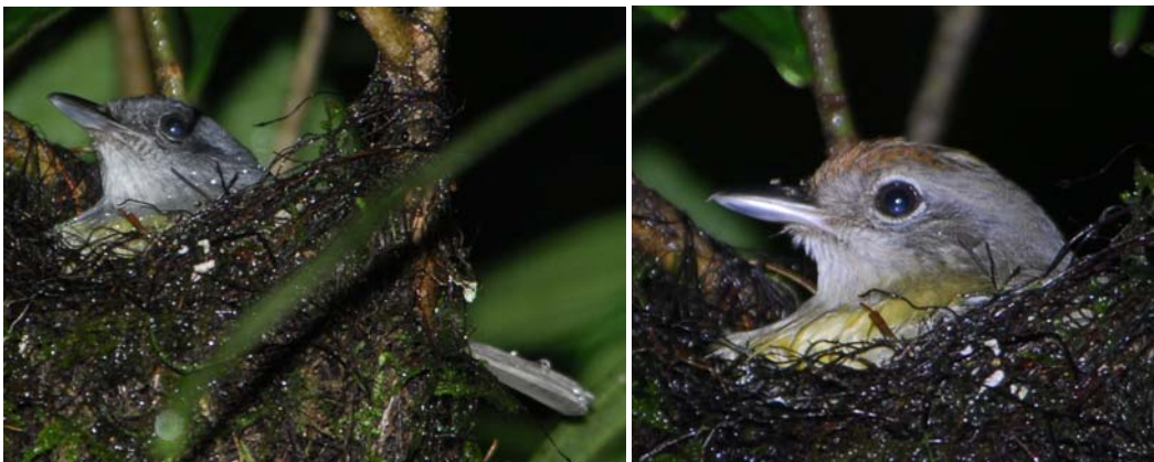
Plain Antvireo (male and female)