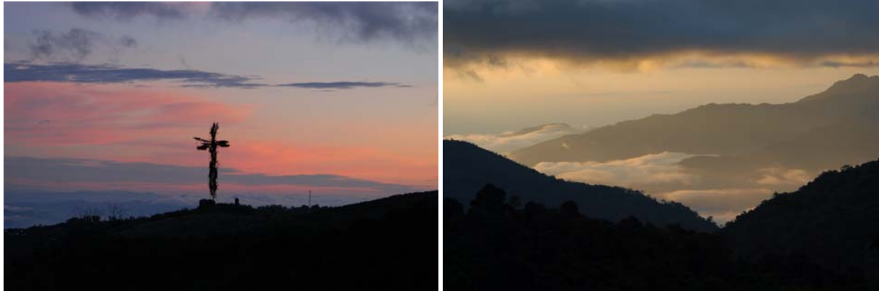
Dawn looking from Yacambú towards Quibor and south across the park, respectively

It's worth noting that the wet season had arrived in Caracas about two weeks before this trip, causing the usual chaos: Landslides and road closures, with the extra complication of the detour to the airport - la trocha - being closed due to landslides from the ill-prepared slopes along its sides. Much of the Andes had also experienced considerable rainfall and Yacambú was no exception. In the end I was probably quite lucky that, despite all but the last day being largely overcast and partly rainy, I did not lose a single day to continuous rainfall - although at times, as I sheltered damply in the car or the El Blanquito huts with rain pelting down outside, I did have my doubts as to whether this would be the case! I managed the weather as best I could by driving up and down the park, birding lower altitudes around the laguna when the rain and neblina were heaviest at the top of the road, then heading back up again once they lifted. Amazingly, every evening as I returned to Sanare the town was dry (and often very windy - especially at the exposed hilltop location of Tierra Blanca). Descending from the park there was a sharp transition zone at ca. 1700m on the Sanare side, with neblina (mist) and rain above that and dry roads below. Guaranteed.