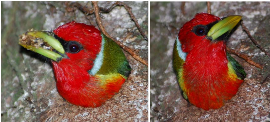
Red-headed Barbet cleaning out the nest and checking out the visitor

Will (the Aussie) has a plot around the laguna at El Blanquito that includes the nest of the glamorous Red-headed Barbets that I saw on my first trip. The adults were now hard at work feeding the nestlings that were becoming more vocal down in their nest hole as they approach fledging. Will was also able to put me out of my misery w.r.t finding the manakins that are reported to be lekking around the laguna . Within minutes of entering the forest between the access road and the laguna we had found the first of several displaying White-fronted Manakins. Easy, when you know where! Apparently this is the only spot that the team have so far seen White-crowned Manakins in Yacambú.