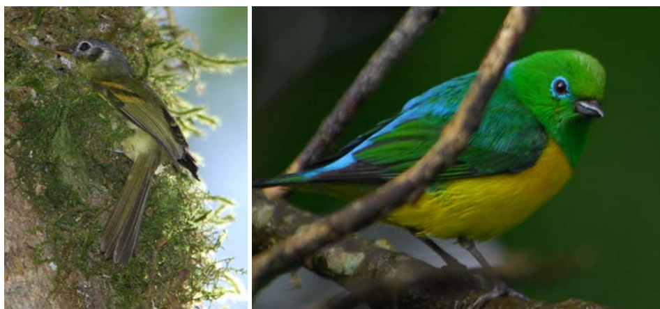
Variegated Bristle-Tyrant; Blue-naped Chlorophonia

Although the supposedly common Golden-winged Manakin remained elusive (to me at least), I did get to see some other interesting or unusual birds typical of the park such as: Northern Helmeted-Curassow (brief glimpses as I was walking along the road a few hundred meters below the blue shrine, with the Curassow furtively checking me out from a few meters inside the forest before heading back down the slope and out of sight amongst the trees); Highland Tinamou (found beside a stream in an area recommended to me by Carolina, the Colombian team member); and Band-tailed Guans (found by the laguna on several occasions).