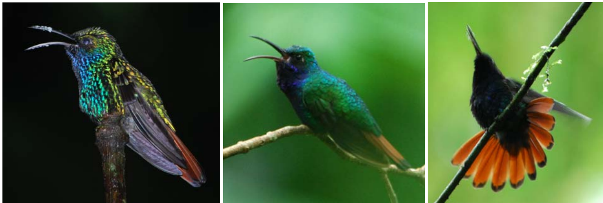
Lazuline Sabrewing - with (extreme left) and without flash

We also discovered a large and very vocal Lazuline Sabrewing in a relatively open patch of forest. Despite working with such a cooperative model, we jointly suffered in our attempts to get decent, naturally lit photos in the modest forest light. As the below examples show, using my external flash indeed delivers enough power to capture him in action - even at some considerable distance - but it also results in degradation of the stunning and subtly varying colours of his reflective feathers. I imagine this common hummingbird problem could be solved with multiple, off-camera flash heads giving more dispersed light sources? Amongst the many dozens of natural light shots that I took and then deleted (isn't digital great!) I did get a couple of decent ones, including a gorgeous tail fan during one stretching session.