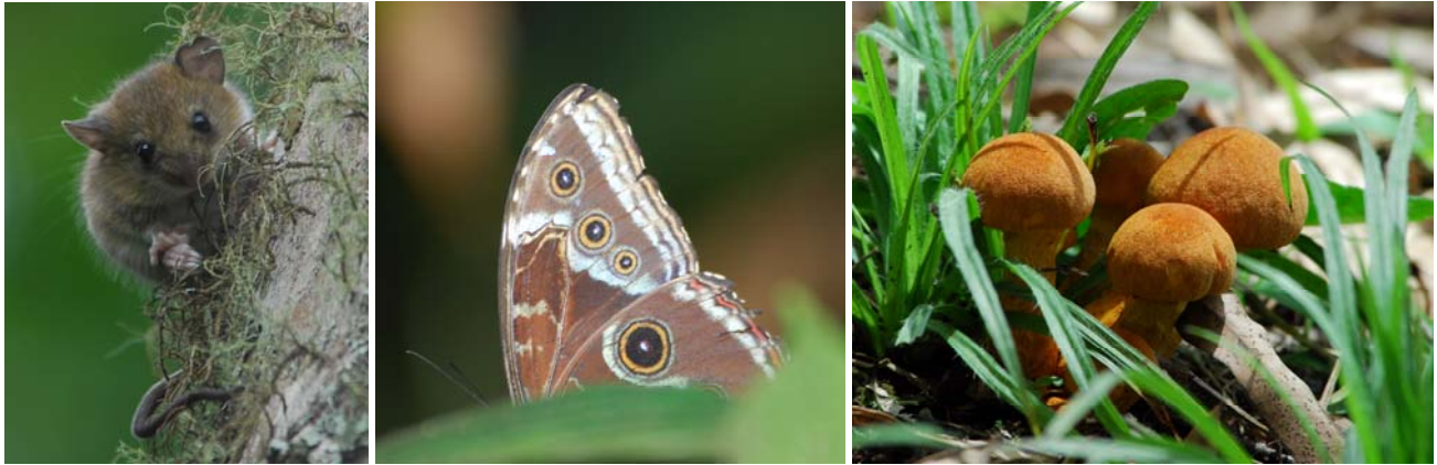
A mouse (marsupial?); Morpho butterfly; Mushrooms