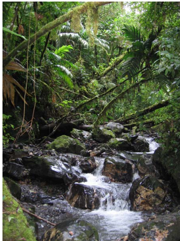
Hiking trail along stream en-route to Red-ruffed Fruitcrow site