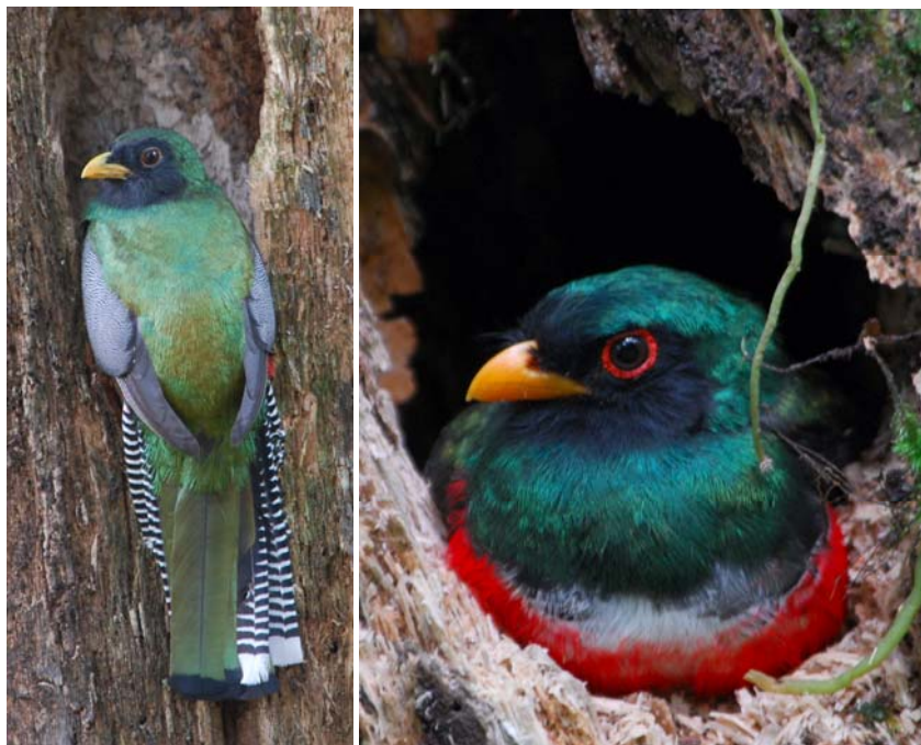
Males on guard: Collared and Masked Trogons

Around the El Blanquito site it was good to see the progress made by the Collared Trogon family whose nest is so precariously located adjacent to the recreation facilities. The two eggs had hatched and the parents were on feeding duty. Maybe the presence of so many people will actually prove to be a bonus by reducing the risk of predation by more wary species? Although the Cascada Trail was relatively quiet whenever I walked it during this trip (previously I had seen many Speckled Hummingbirds amongst multiple other species at almost every corner, this time almost none), I did find a Variegated Bristle-Tyrant pair building their nest in moss on a tree trunk. That was my sole contribution to the team's nest portfolio (albeit an interesting one, since it was the first seen for this species by the team) in return for all their helpfulness in showing me a few of the hundreds of other nests that they had already found!