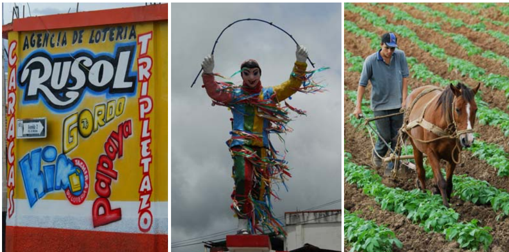
Urban and rural life in Sanare