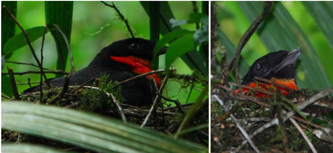
Red-ruffed Fruitcrow (f)

On the way home I passed through Tintorero, where I bought a couple of extra hamacas and spent a few minutes admiring the craftsmanship and colours of the weaving machines (see photos below).