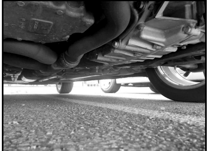
This is what your 20 year old mini van's underside could look like if it never left Pahrump, Nevada. Too bad it does not work this well on humans! Also check out how clean the motor is!

I have not thought about this much in the past but a major portion of our best and favorite suppliers are family-owned or employee-run companies. My family may own Island Hardware, but it's run by its great employees. Every one of them!