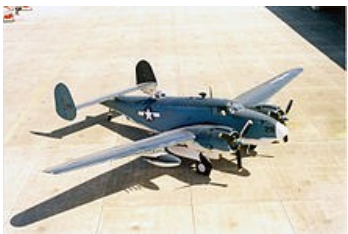
PV-2 HARPOON (BUNO 37230) at the National Naval Aviation Museum Naval Air Station Pensacola FL 18 JUN 2009

One of his boys slipped around to the port side of the harpoon. He'd seen an open hatch and one of our crewmen standing near it. The younger man had decided to ask, plead, "beg if he had to" for permission to let his father climb aboard a Harpoon just one more time. Please, please!