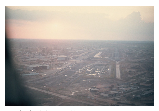
Phuch Vinh – Late 1970