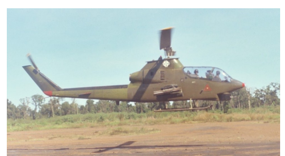
"Blue Max" Cobra – Cambodian Border