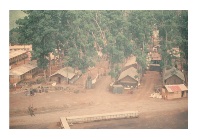
Quan Loi – May 1970