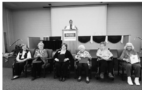
Women who paved the way for us in military service were recognized at the Florida Women Veterans' Conference.