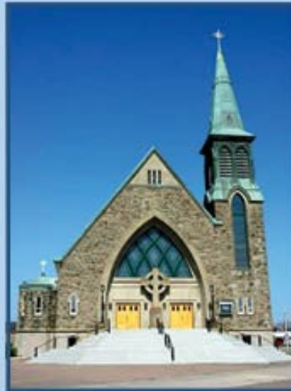
Saint Augustine's Moncton