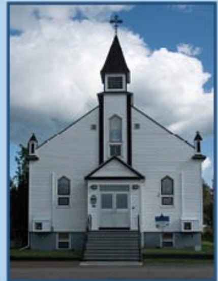
Our Lady of Mercy Pointe-du-Chêne