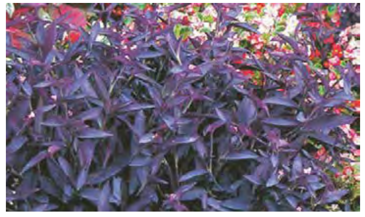
Tradescantia (Wandering Jew) is a species of Spiderwort and can be extremely invasive if planted in the ground. It will send runners everywhere. When trying to keep it in check, you must be sure to get all sections of the plant even those underground. A hanging basket or pot would be better but be careful that pieces don't break off and root in your garden.

Bamboo comes in 2 types, running and clumping. Even if "advertised" as Clumping Bamboo it may not be so. Planting in a pot and setting pot on a concrete paver is the only way to grow Bamboo if you want to keep it under control. Also, check periodically to make sure roots haven't escaped from the drainage holes and become rooted in the soil.