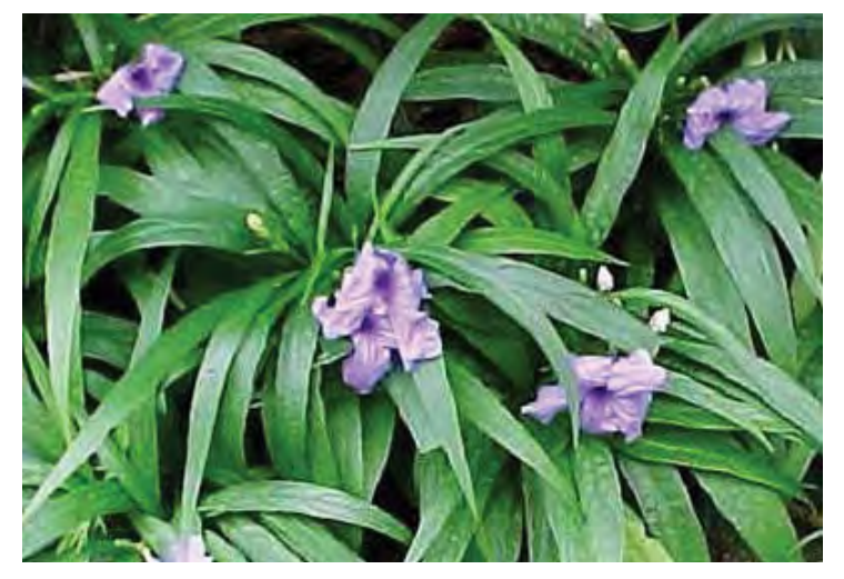
Ruellia (Mexican Petunia) can withstand both wet and drought conditions and full sun or shade. It spreads through rhizomes under the soil as well as aggressively self-seeding, in other words, a double whammy.

Campsis (Trumpet Vine) . There are a couple of things that make this plant so invasive. One it spreads via underground runners or roots throughout your garden bed, lawn and up any nearby trees or shrubs. Second, it thrives on neglect. Although the flowers are beautiful and attract hummingbirds, keeping it under control may require chopping the roots back frequently since it is a rapid grower.