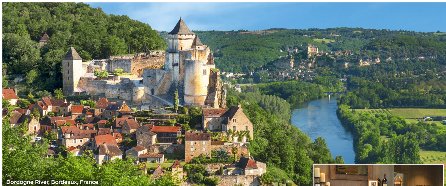
Dordogne River, Bordeaux, France

Uncork local traditions, savor intense flavors and enjoy palate-pleasing adventures during an AmaWaterways Wine Cruise