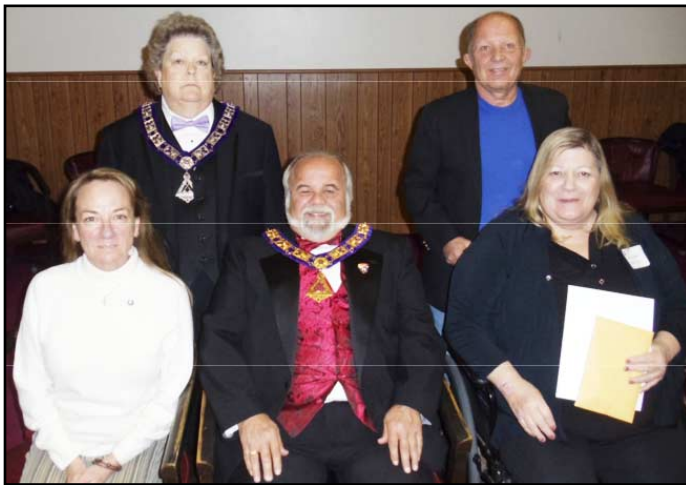
Class named in honor of Veterans