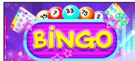
on Dec. 1 and Dec. 15 at 6:30