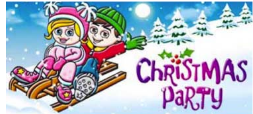
Kids Christmas Party Dec. 18th -12:00-2:00