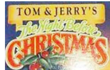
Tom & Jerry's Dec. 24th 3:00-6:00