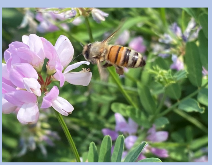
June 14- Crown Vetch, Mission, KS