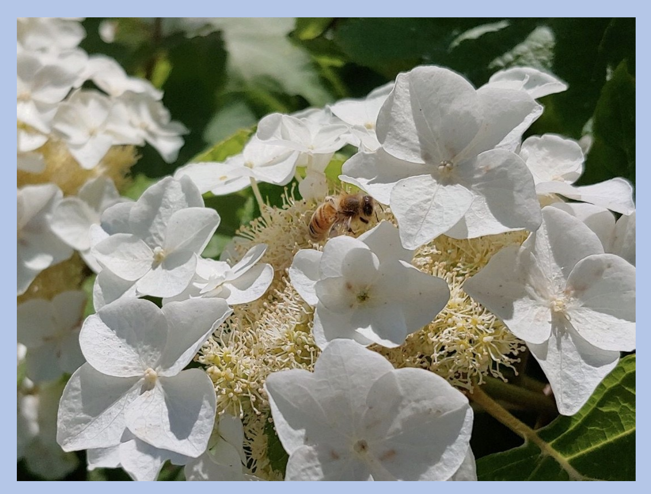
June 11 -Oakleaf hydrangea, Olathe, KS