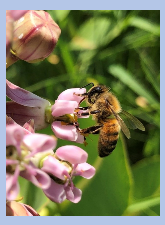
June 14 – Common Milkweed, Berryton, KS