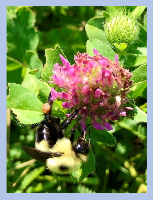
June 17- Red Clover, Dover, KS