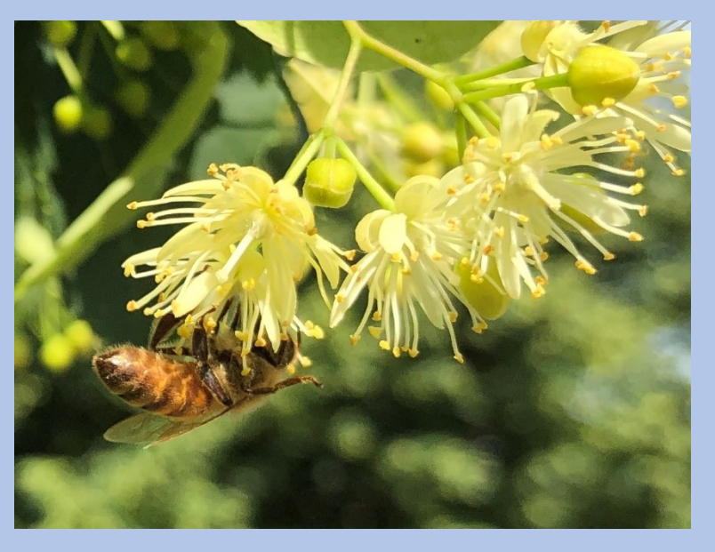
June 8 – Little Leaf Linden, Berryton, KS