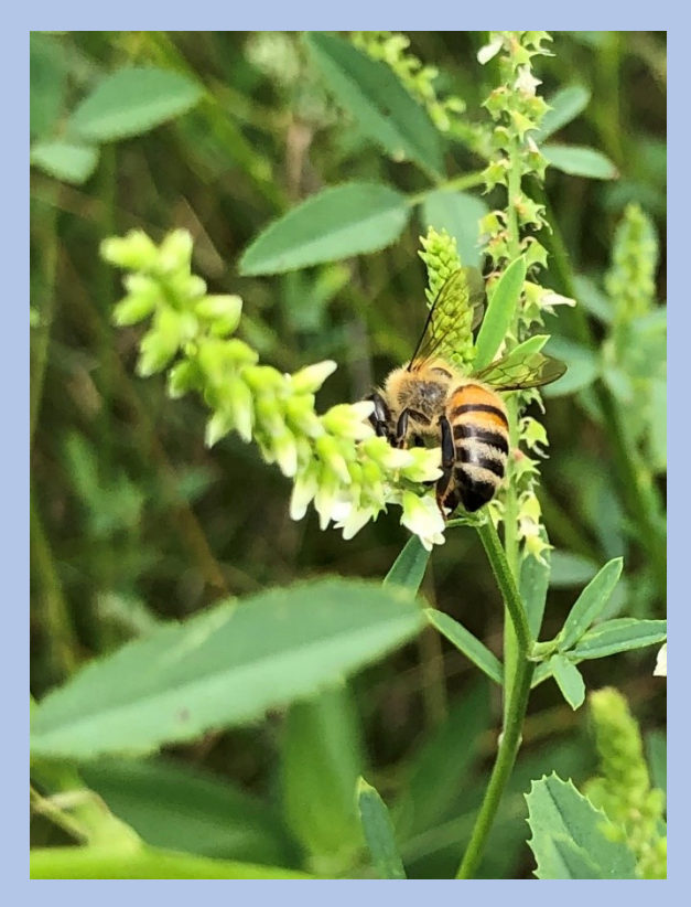
July 4-White Sweet Clover, Berryton, KS