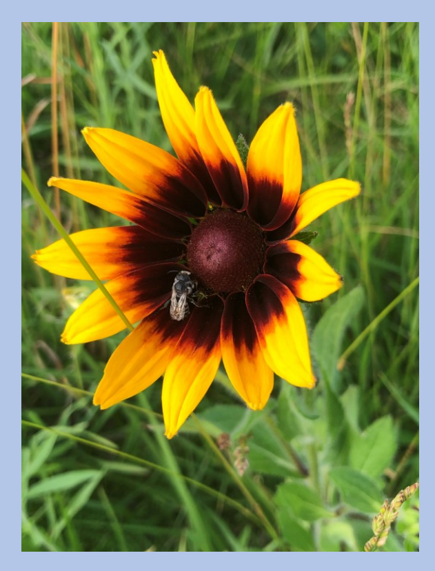
June 14 -Rudbeckia hirta, Berryton, KS