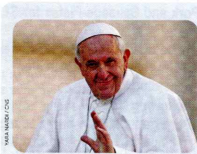
YARA NARDI / CNA