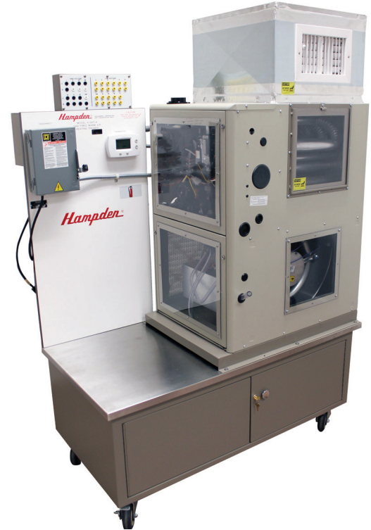
Model H-GHT-4 Gas Fired Warm Air Heating Trainer Dimensions: 79-3/8"H x 62"W x 28"D Shipping Weight: 600 lbs.