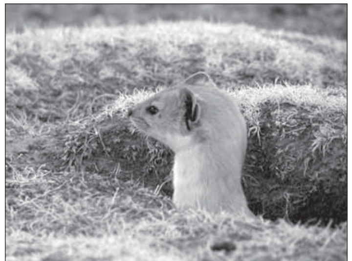
Altai weasel photographed on the Tibetan plateau.