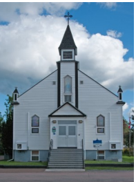
Our Lady of Mercy 11 St. Andrews Street Pointe-du-Chêne, NB