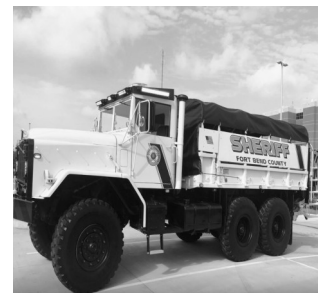
Fort Bend County Sheriff's High Water Vehicle was amazing to see. It was a big hit to our residents.

your neighbors, your street, your community. Send a message to criminals...they are not welcomed in our community or anywhere!