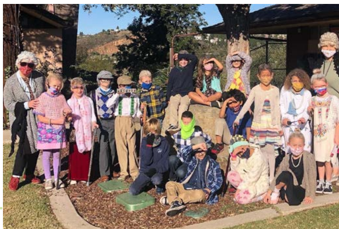
Above: Second-grade created pictures of what they thought they would look like at 100-years-old.