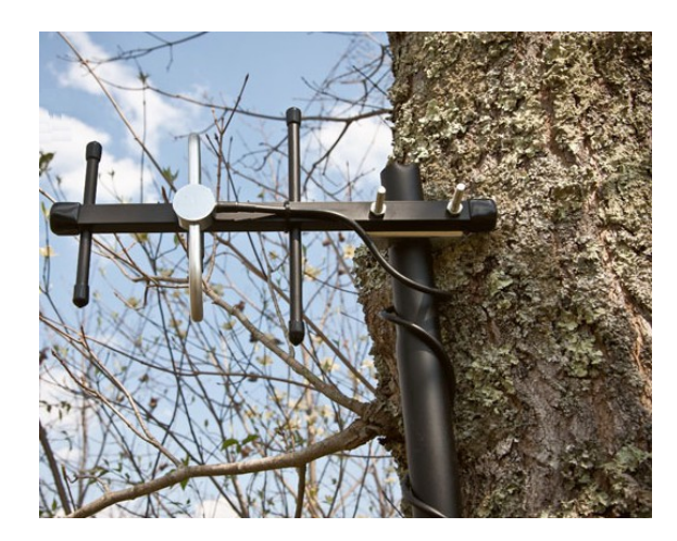
Figure 2. Directional (Yagi) Antenna

For areas where it is difficult to get a good signal, a high gain directional antenna (Yagi) is generally the best choice. The only limitation with directional antennas is that they are not suitable for devices used as repeaters. This is due to the fact that they must pointed in the direction of the device they will be communicating with. A repeater must communicate with more than one device, therefore a directional antenna is not a good choice for a device that will be used as a repeater.