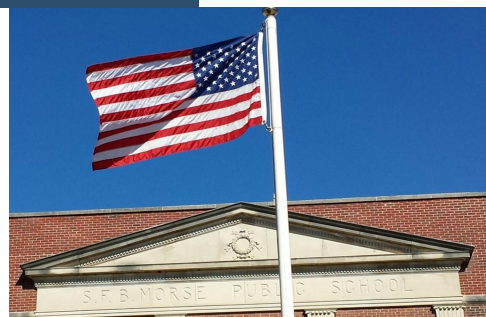
Page 11 Shir Chadash December 2016