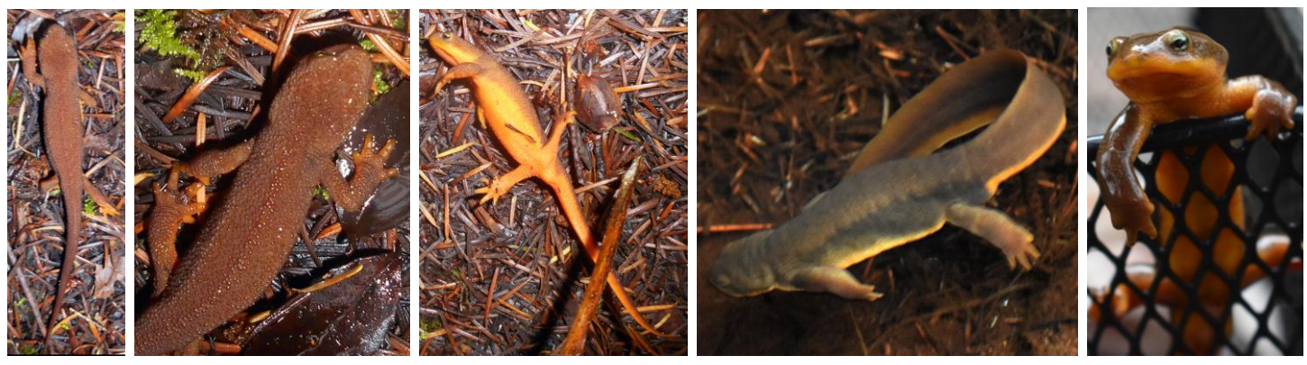
Rough-skinned Newt (Taricha granulosa) (Grainy-skinned terrestrial stage, and smoother aquatic stage)

Northwestern Salamander (Ambystoma gracile) (Large poison glands behind eyes and atop tail)