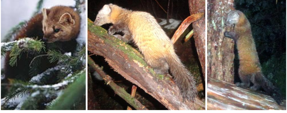
American Marten (Martes americana) (rarely seen)