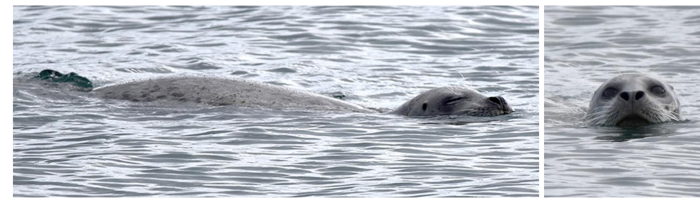
Harbor Seal (Phoca vitulina) (feeds in Siuslaw River and around jetties)