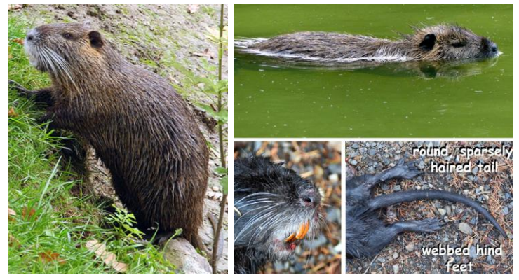
Coypu (Myocastor coypus) (beaver-like teeth)

North American River Otter (Lontra canadensis) (long-bodied; feeds in lakes; often curious)