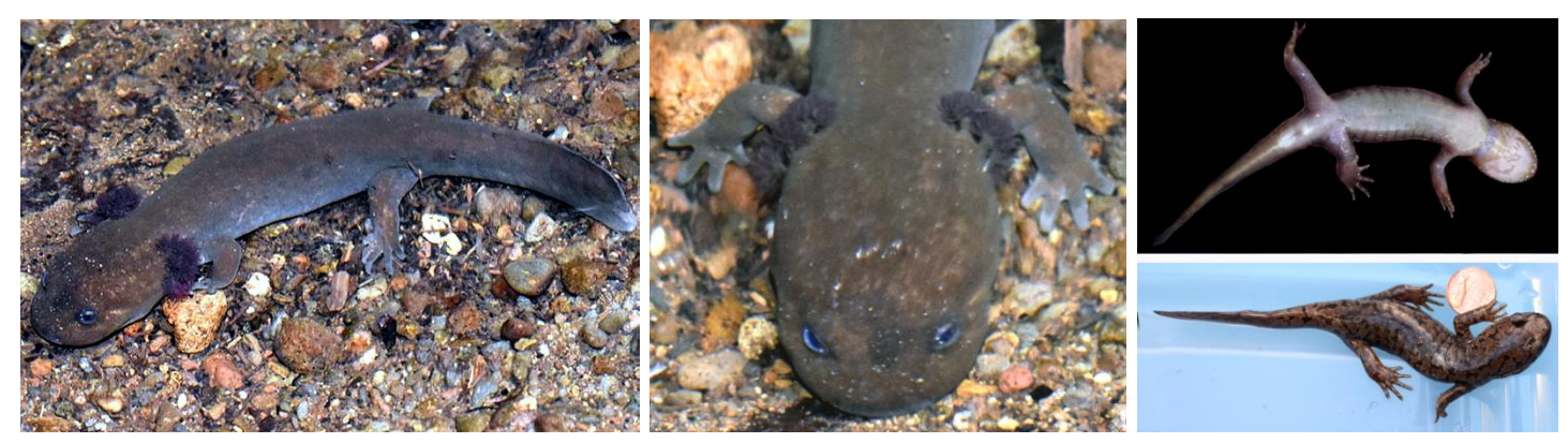
Coastal Giant Salamander (Dicamptodon tenebrosus) (4 toes on front feet, 5 toes on hind feet; the swimming animal with gills expanded was about 8 inches long; the smaller animal was on land, traversing a lawn)