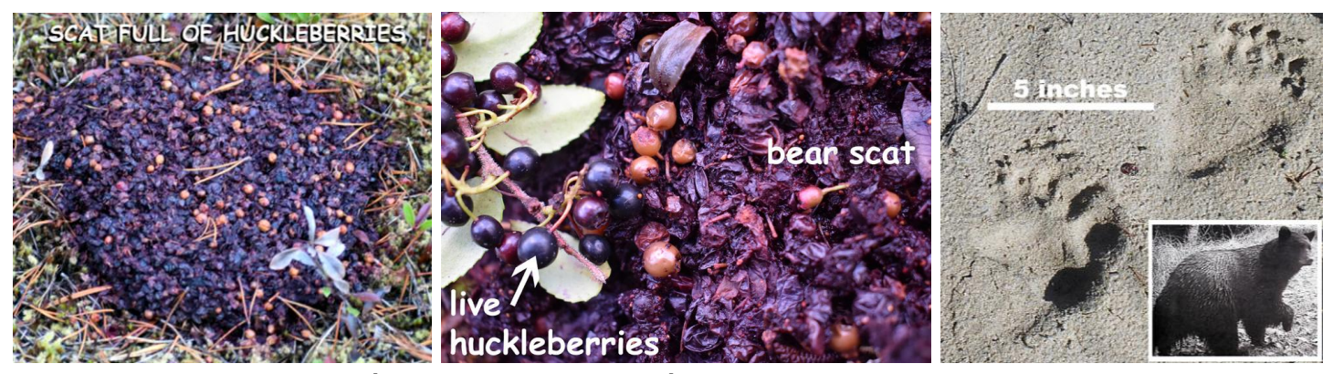
American Black Bear (Ursus americanus) (scat and tracks common; trail camera photo in Sutton Area)