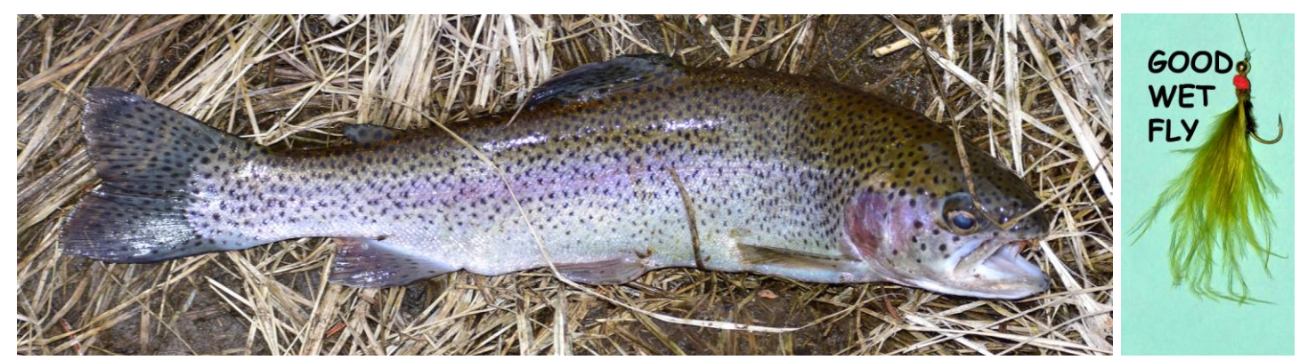
Rainbow Trout (Oncorhynchus mykiss) (stocked in local lakes by Oregon Department of Fish & Wildlife)