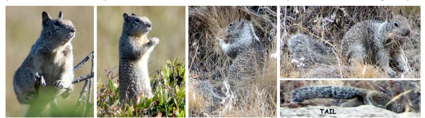
California Ground Squirrel (Citellus beecheyi) (white shoulders)