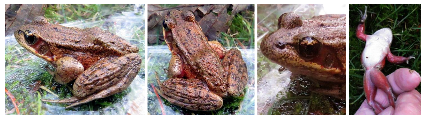
Northern Red-legged Frog (Rana aurora) (Legs red underneath)