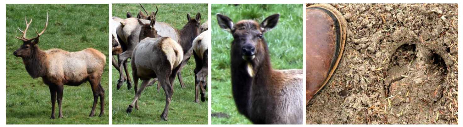
Wapiti (Cervus canadensis) (large Elk; pale tan rump; stubby tan tail; tracks common around Baker Beach)