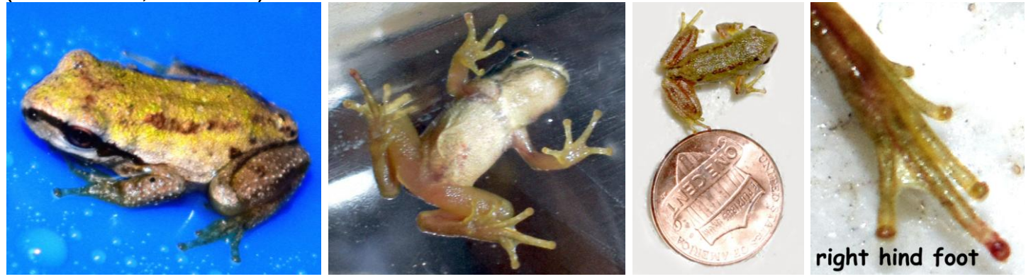
Northern Pacific Tree Frog (Pseudacris regilla) (numerous in the bush; loud, persistent chorus)