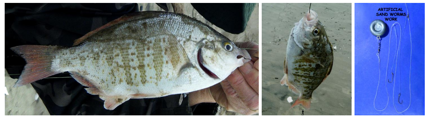
Redtail Surf Perch (Amphistichus rhodoterus) (Popular sport fish along beaches, in surf)