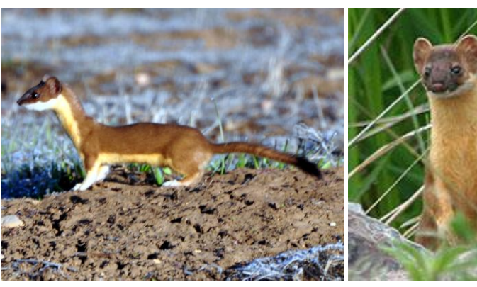
Long-tailed Weasel (Mustela frenata) (drawing from memory)