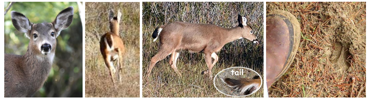
Columbian Black-tailed Deer (Odocoileus hemionus ssp. columbianus) (black tail top)