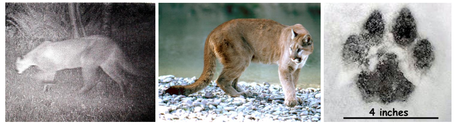
Cougar (Puma concolor) (large, up to 200 pounds; long tail with brown tip; trail camera photo in Sutton Area)