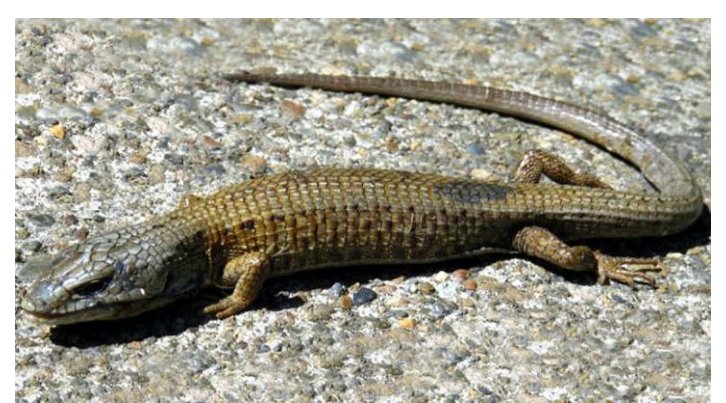
Northern Alligator Lizard (Elgaria coerulea)