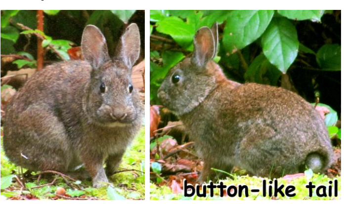
Brush Rabbit (Sylvilagus bachmani)