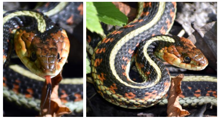
Red-spotted Garter Snake (Thamnophis sirtalis concinnus)