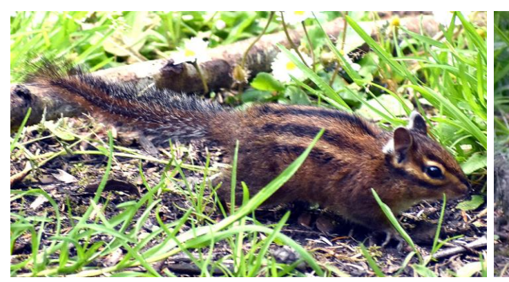
Townsend's Chipmunk (gray behind ears) (Tamias townsendii)