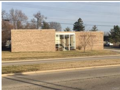
2507 N Verity Parkway Middletown OH 45042 2403

Listing # 727663 Property Type Commercial Property SubType Office Status Active Area SqFt (approx) Acreage 0.25 Lot SqFt 10,777 Subdivision Year Built 1961 Beds/Baths 0/0 School District House Level Basement Garage