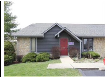
1002 N University Boulevard Middletown OH 45042 3300

Listing # Property Type Property SubType Status Area SqFt (approx) Acreage Lot SqFt Subdivision Year Built Beds/Baths School District House Level Basement Garage Original Price Orig PR/SF Listing Date Listing Price List PR/SF Sold Date Sold Price Sell PR/SF Financing CDOM