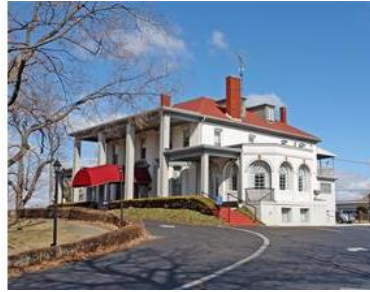
1632 Wayne Avenue Dayton OH 45410 1710

Original Price $399,900 Orig PR/SF Listing Date 09/07/2017 Listing Price $399,900 List PR/SF Sold Date Sold Price Sell PR/SF Financing CDOM 448