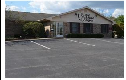
146 N Breiel Boulevard Middletown OH 45042 3806

Listing # 750742 Property Type Commercial Property SubType Office Status Active