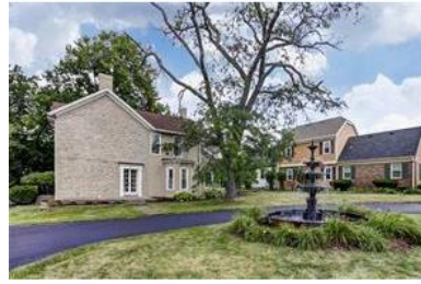
15 Irongate Park Drive Centerville OH 45459 4616

Original Price $200,000 Orig PR/SF Listing Date 10/16/2017 Listing Price $200,000 List PR/SF Sold Date Sold Price Sell PR/SF Financing CDOM 43