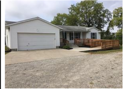
8468 Upper Miamisburg Road Miamisburg OH 45342 1543

Listing # 745696 Property Type Commercial Property SubType Office Status Active