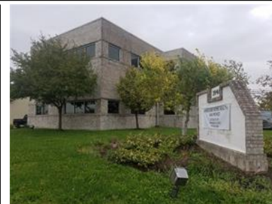
3946 Kettering Boulevard Moraine OH 45439

Listing # 751767 Property Type Commercial Property SubType Office Status Active