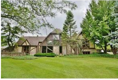
110 Breiel Boulevard Middletown OH 45042 3806

Listing # 747308 Property Type Commercial Property SubType Office Status Active Area SqFt (approx) Acreage 1.00 Lot SqFt 43,499 Subdivision Year Built 1977 Beds/Baths 0/0 School District House Level Basement Garage