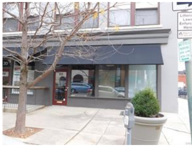
22 S St Clair Dayton OH 45420