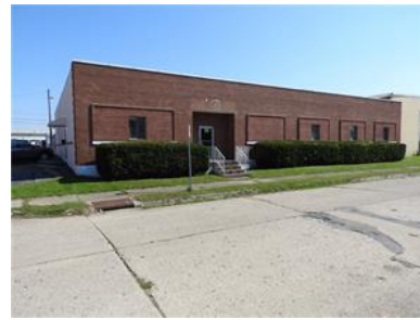
1440 Milburn Avenue Dayton OH 45404 1676