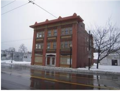
1000 3rd Street Dayton OH 45402 6815

Listing # 750029 Property Type Commercial Property SubType Office Status Active Area SqFt (approx) Acreage 0.15 Lot SqFt 6,521 Subdivision Year Built 1914 Beds/Baths 0/0 School District House Level Basement Garage