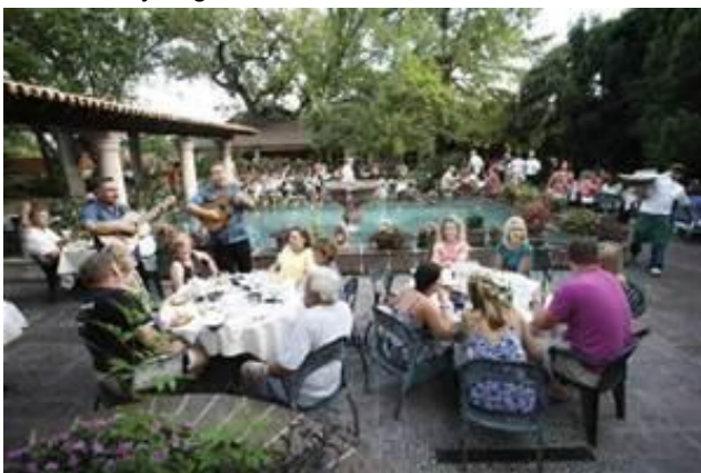
Joe T. Garcias Mexican Restaurant, a superb culinary experience. ( www.joets.com )

Ride the BULL at the world-renowned (and world's largest) "Billy Bob's" Honky Tonk. This will really get you into the cowboy/cowgirl atmosphere. There will be some options available for this event for those who wish to take it to the western extremes and will be offered once you arrive at the reunion. ( www.billybobstexas.com )