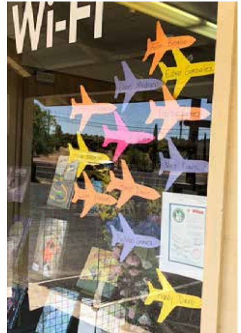
Window display of the Summer Reading participants.

by Patty Smalling Angels Camp Library Branch Assistant