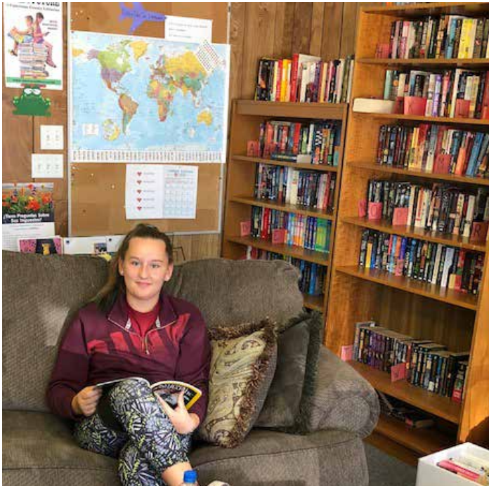
A patron enjoying our reading area.

As another fun activity, the branches were all given a world map with stickers to place on your favorite place you've been, or that reading has taken you. Luckily we had one place on one wall to display it.