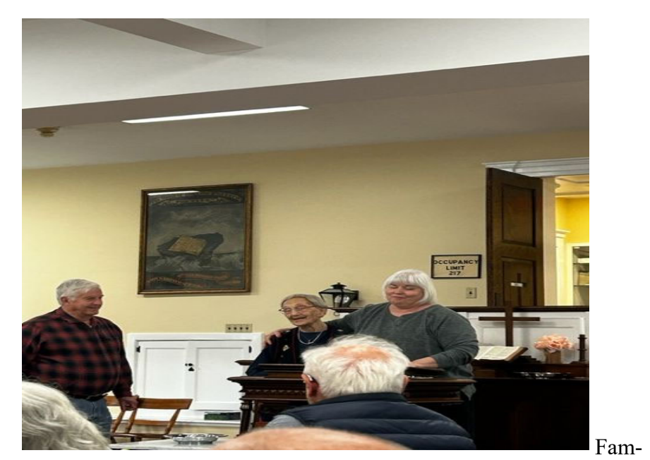
ily Night 2023