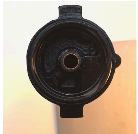
Closed ear design late 1931 - and replacement part perhaps as stock of open year design was used up