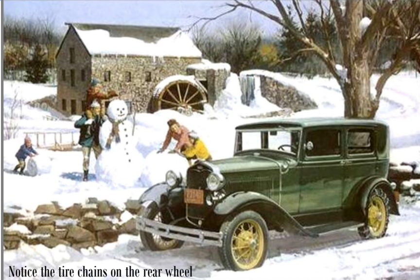
Notice the tire chains on the rear wheel