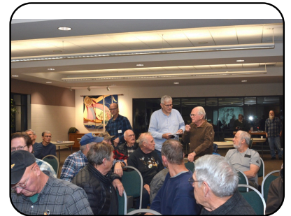
New clinic visitor gets welcomed