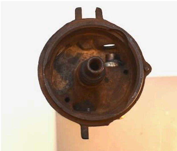
Open ear design, (broken ear) 1928- 1931

The open ear distributor body was used from 1928 thru end of production. Late in the last year of production and perhaps replacements made after had a "closed" or bridged ear. This style is stronger, less prone to breakage; however, I would still use some padding in the container stored within the car.