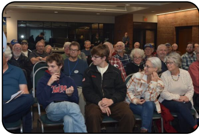
Well attended night