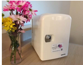
Here is a photo of a mini-refrigerator the Foundation donated to RMH of Michiana.

The Sweet Pea Foundation was honored to donate 20 mini-refrigerators, one for each of the guest bedrooms. This will allow nursing mothers to store milk for their sick children in the privacy of their own rooms.