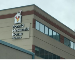
Ronald McDonald House of Michiana in South Bend, IN.

We recently toured the new Ronald McDonald House of Michiana which was built across the skyway bridge from the new Beacon Children's Hospital. With the construction of the children's hospital complete, there was certainly a need for the Ronald McDonald House to grow as well. And it sure did! From a three-bedroom facility that opened in