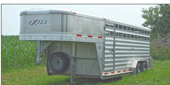
2014 EXISS 7 ft.x20 ft. Aluminum Stock Trailer (Tandem Axle, - Low Mileage)