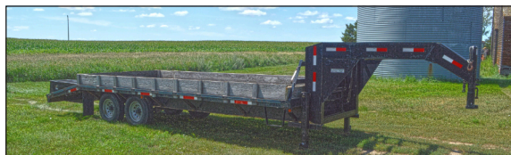
2002 DIAMOND 8 foot x 24 foot Tandem Axel Goosneck - Flatbed Trailer