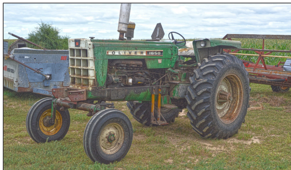
1966 OLIVER Diesel Tractor (Model 1650, Vin-177923-452, 13661 hours, 3 Point)