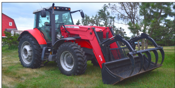
2010 MASSEY FERGUSON Diesel Tractor (Model 7485, SN. - V278009, with MASSEY 975 Loader, Bucket and Grapple, 5683 Hours, 3 Point.)