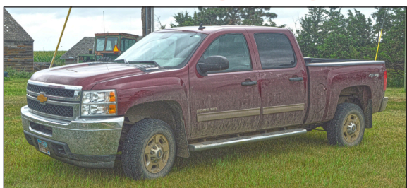
2014 CHEVROLET 2500 Silverado Pickup (4 x 4, ¾ ton, 39500 miles)