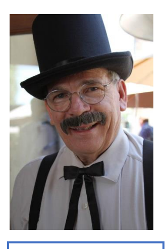
Bride's Escort: He lent the bride a supporting arm