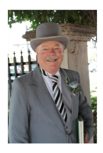
Justice of the Peace: Proclaimed "Lordsburg No

They recessed to the tune "There'll be a Hot Time in the Old Town Tonight!"