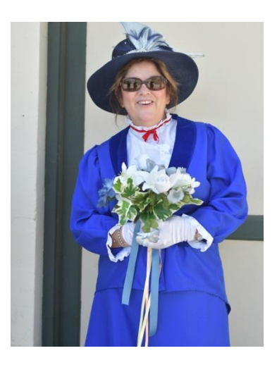
Bride's Attendant 2: Hang onto your bouquet!