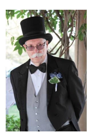
Best Man & Singer: Led us in praiseful song of our city