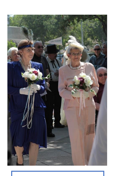
Bride's Attendants 3 & 4: A mother/daughter team!