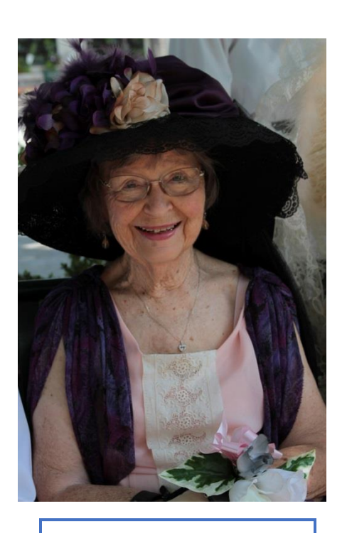
Bride's Attendant 6: Big hat... bigger smile!