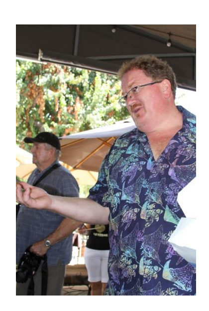
The Innkeeper: The host with the most