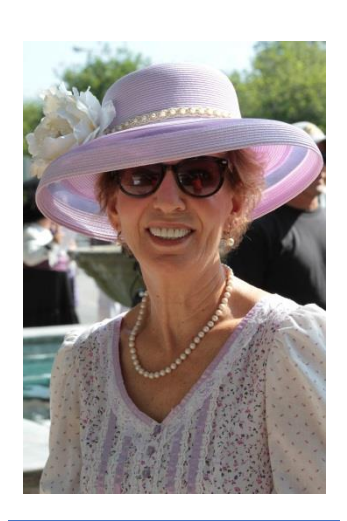
Bride's Attendant 1: Cool as a cucumber