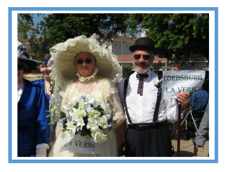
Miss Lordsburg & Mr. La Verne:

They recessed to the tune "There'll be a Hot Time in the Old Town Tonight!"