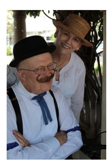
Musician & His Helper: Entertainers with Pizzazz