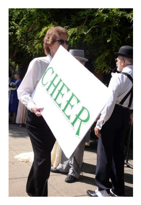
The Sign Carriers:

Told us when to cheer & when to just shut up!