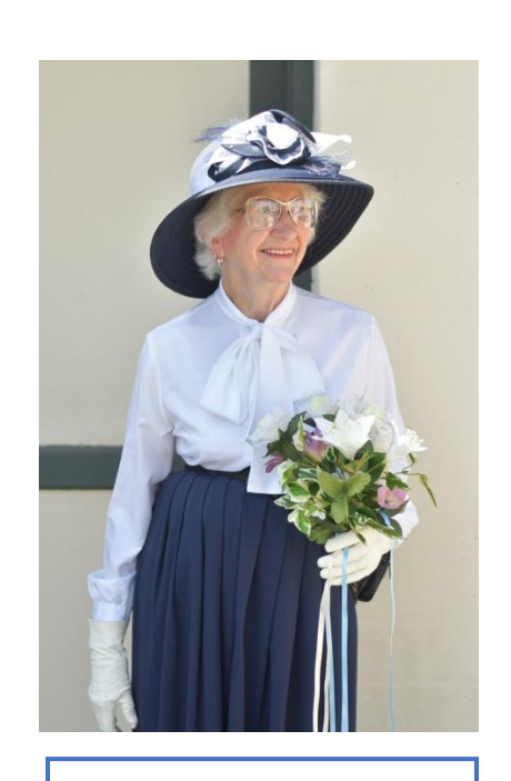
Bride's Attendant 5: Poised and elegant