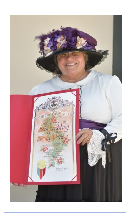
The Announcer: Gave us a history lesson & shows off a scroll