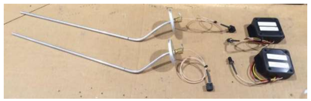
New Probes and Sending Units

The factory has also moved to a different fuel probe. The fuel probe is manufactured by Princeton and features a remote mounted sending unit. The factory experience is that if something fails, it is usually the EPROM in the sending unit and not the probe itself. The sending unit can be mounted anywhere the builder likes.