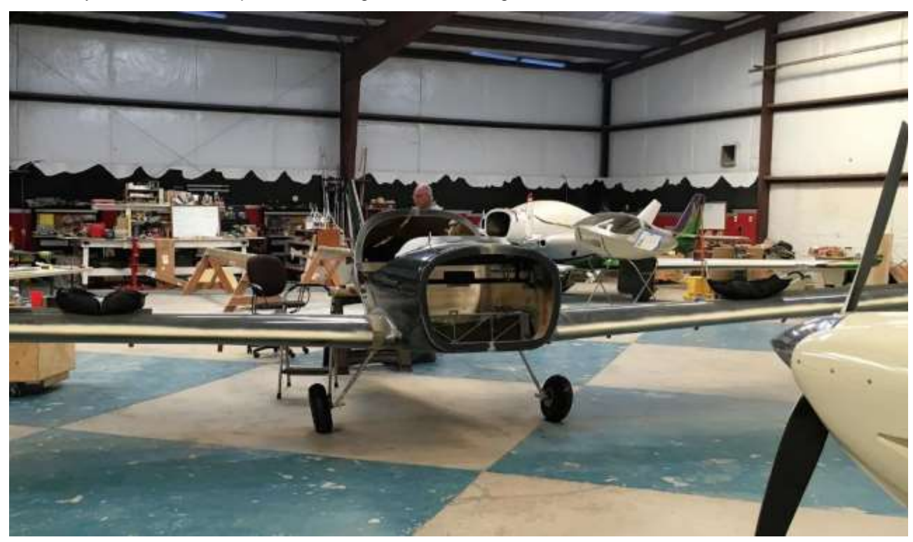
A Lot of Work Gets Done in the First Week

And before you know it, the airplane is on its gear with the wings attached.