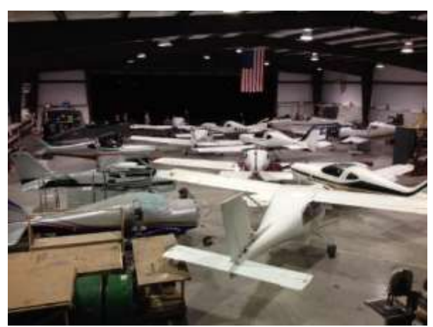
A Picture from the Loft of a Packed Hangar

We all met for dinner at the Bell Buckle Café in beautiful Bell Buckle, TN. There was live Blue Grass music while we dined and the country cookin' was amazing as always. A couple of parting shots for your enjoyment. I can't let this article go without mentioning the Arion Aircraft pickup truck. This truck is haunted. I am not kidding. You turn off the radio and after a minute or two, it comes back on. Turn it off, and it comes back on. Ask Bear, he agrees with me. I should have taken a picture.