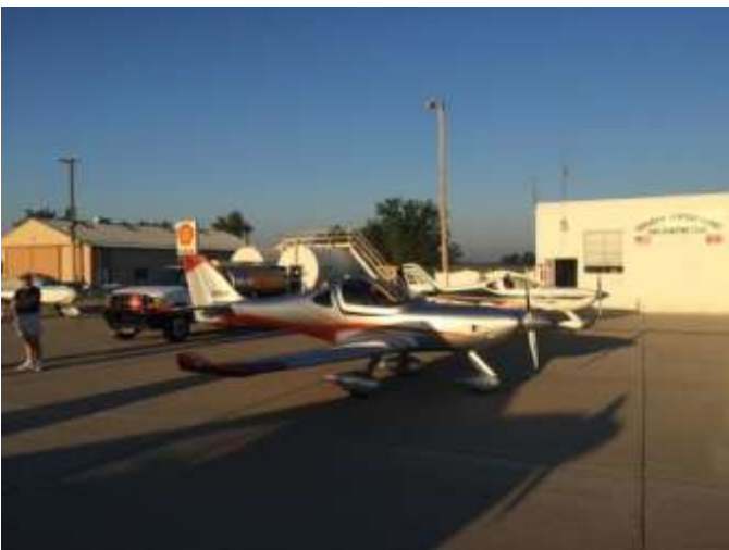
The Jets at the Pancake Breakfast