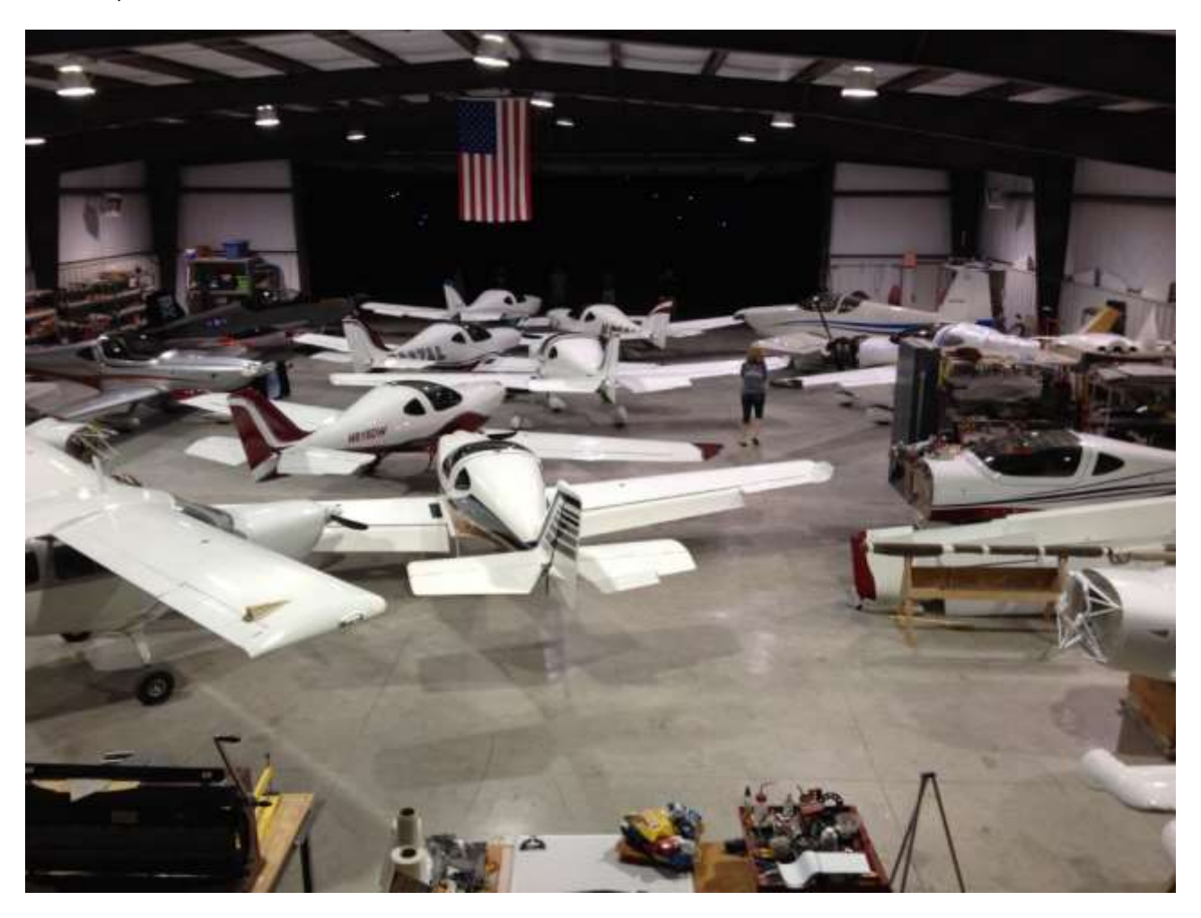
Another View of the Packed Arion Hangar

Russia and CIS, AVIA-NIANIA Ltd, Moscow, Russia, Phone: + 7495518-62-75, Mobile Phone: + 7925518-62-75, avianiania@mail.ru or avianiania@aol.com