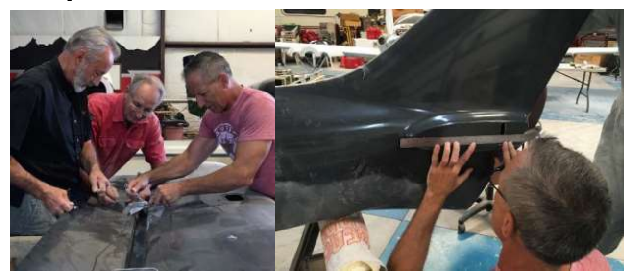
Installing the Flaps

This build is moving right along and we should be able to see a finished or nearly finished airplane in the next issue of "Hangar Talk" Magazine.