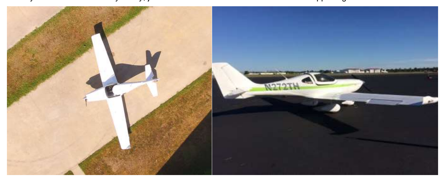
How About an Aerial View?

I purchased the lightning, serial number 73, from the 2nd owner, the plane only had 98 hours on it even though it a 2009 model. As this is written, in the 6 months I've owned it, I've put over 70 hours on it!!!!!! This lightning is an EAB and does not meet LSA requirements. It was factory assist built. I fly local flights along with long distance flights from Tulsa including Destin, Dallas, and of course, Oshkosh. As an A&P mechanic I've made many corrections to the aircraft from radio antennas, control surface rigging, fuel selection and indicator corrections, landing gear alignments, ignition system, and the list goes on. I suspect this why it had only flown 98 hours between its first two owners before I purchased it. Thankfully none of this was really costly, just needed a fresh look at what should be happening and what was!