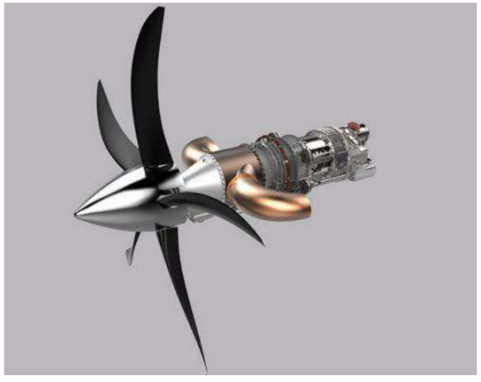
Turboprop Lightning Anyone?

Have you ever thought about a real Jet Lightning? Well, there is a turboprop engine manufacturer that is interested in having one of their engines mounted on a Lightning. They have a couple small engines that would work well and negotiations are in process. They are developing an engine that would be perfect for the Lightning, a 200 shp engine that weighs in at 150 lbs.