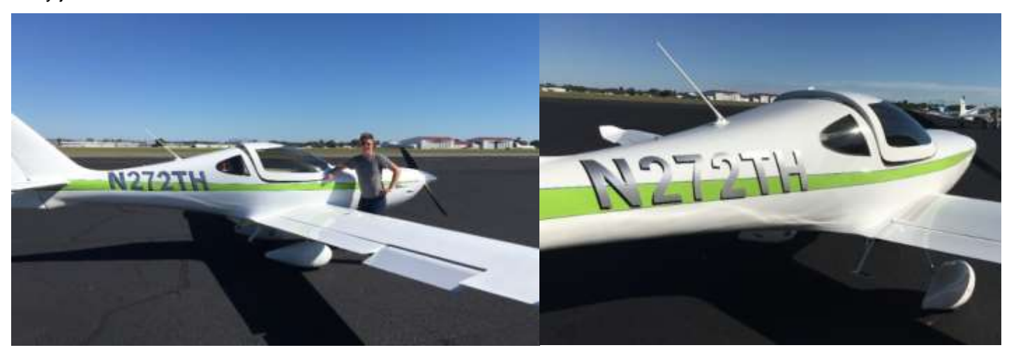
A Very Nice Jet

and posting them on YouTube. I hope to do a small amount of commercial photography / Videography on the side as a hobby job.