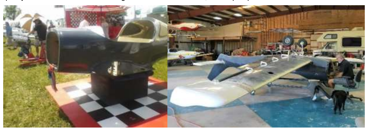
The New Build at AirVenture

I am pretty sure this is the same fuselage we saw at AirVenture, so I kept a picture of it from the last issue.