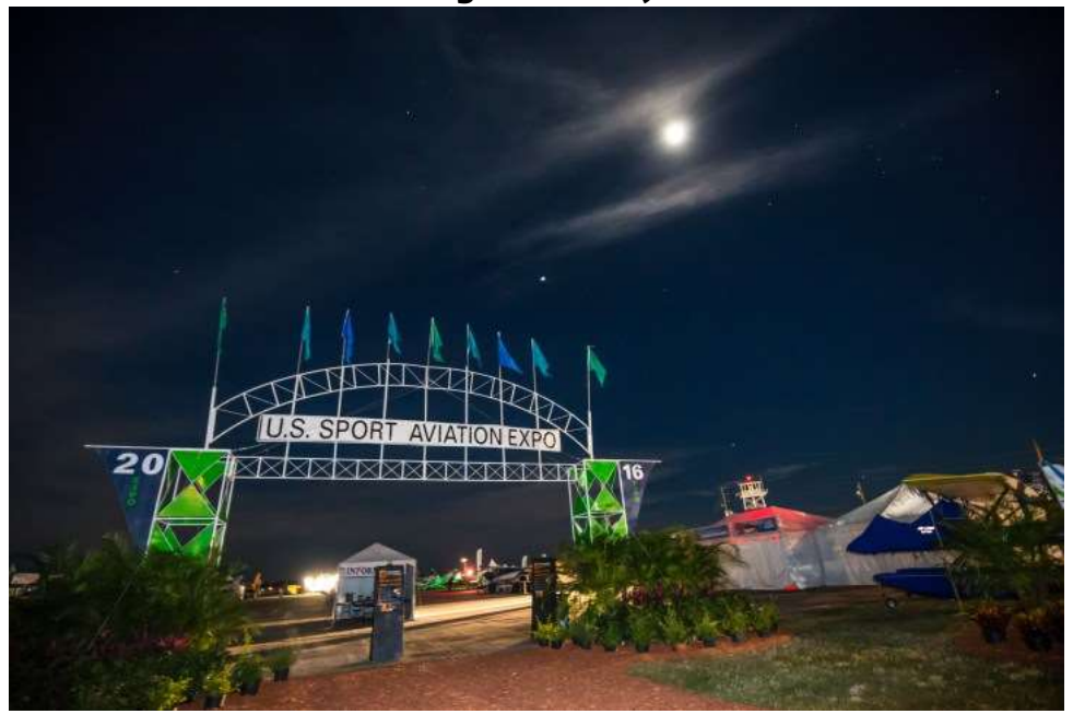
<u>LSA Expo - Sebring, FL</u> Airport Identifier – KSEF

US Sport Aviation Expo - Sebring, FL January 25-28, 2017