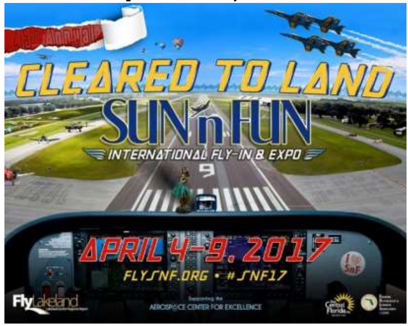
Sun-N-Fun Airport Identifier - KLAL

Sun – N- Fun Fly-In–Lakeland, FL April 04-09, 2017