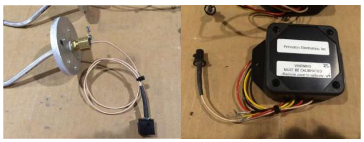
Close-ups of Probe Mount and Sending Unit

Have you ever thought about a real Jet Lightning? Well, there is a turboprop engine manufacturer that is interested in having one of their engines mounted on a Lightning. They have a couple small engines that would work well and negotiations are in process. They are developing an engine that would be perfect for the Lightning, a 200 shp engine that weighs in at 150 lbs.