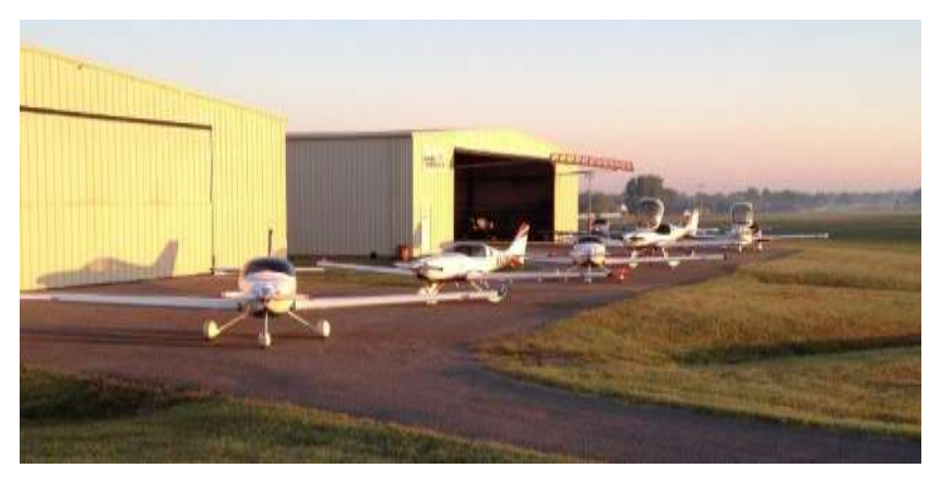
Getting Ready to Taxi to Breakfast