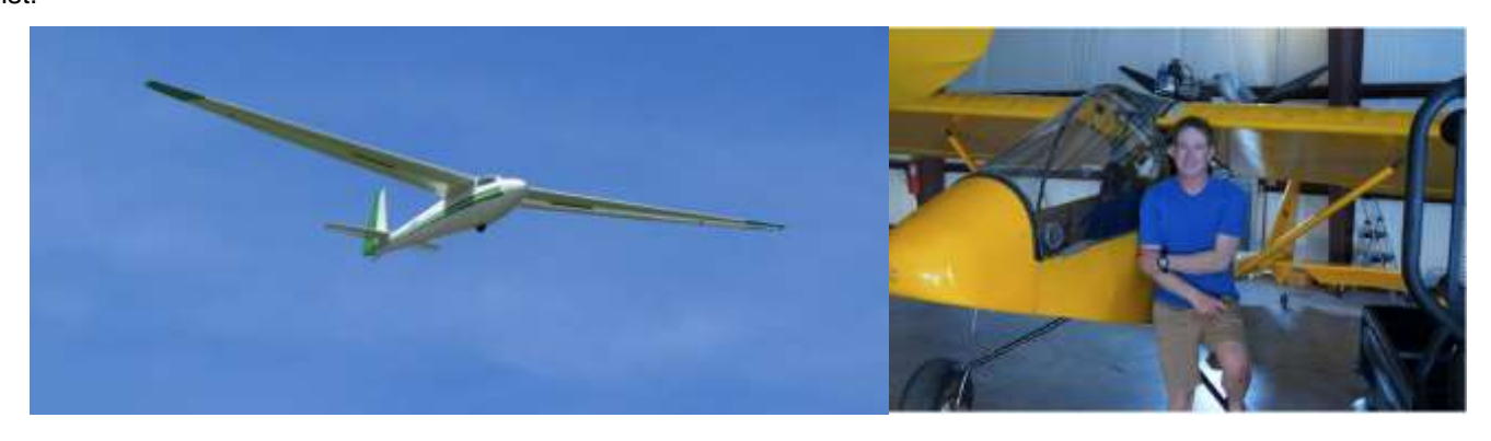
The Ka6CR Glider "Gigi"

I owned a Ka6CR sailplane back in high school, then had a Kolb Slingshot just before the Lightning. The sailplane was getting too much to put together on hot Oklahoma weekends so I sold the glider. I had only owned the Kolb for about 8 months before purchasing the Lightning this March 2016. The Kolb didn't really allow passengers and did not have a heater. When I found the Arion for sale, I jumped on it! All three aircraft were great; I just was ready for something a bit sleeker. The Arion resembled the sailplane with similar aerodynamics, the fuel efficiency of the Kolb relative to speed, and most of the amenities and qualities (or better) compared to its standard category rival, the Cirrus SR20, so I couldn't resist!