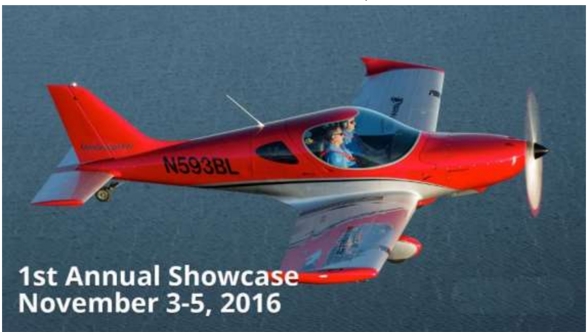
Deland Sport Aviation Village and Expo