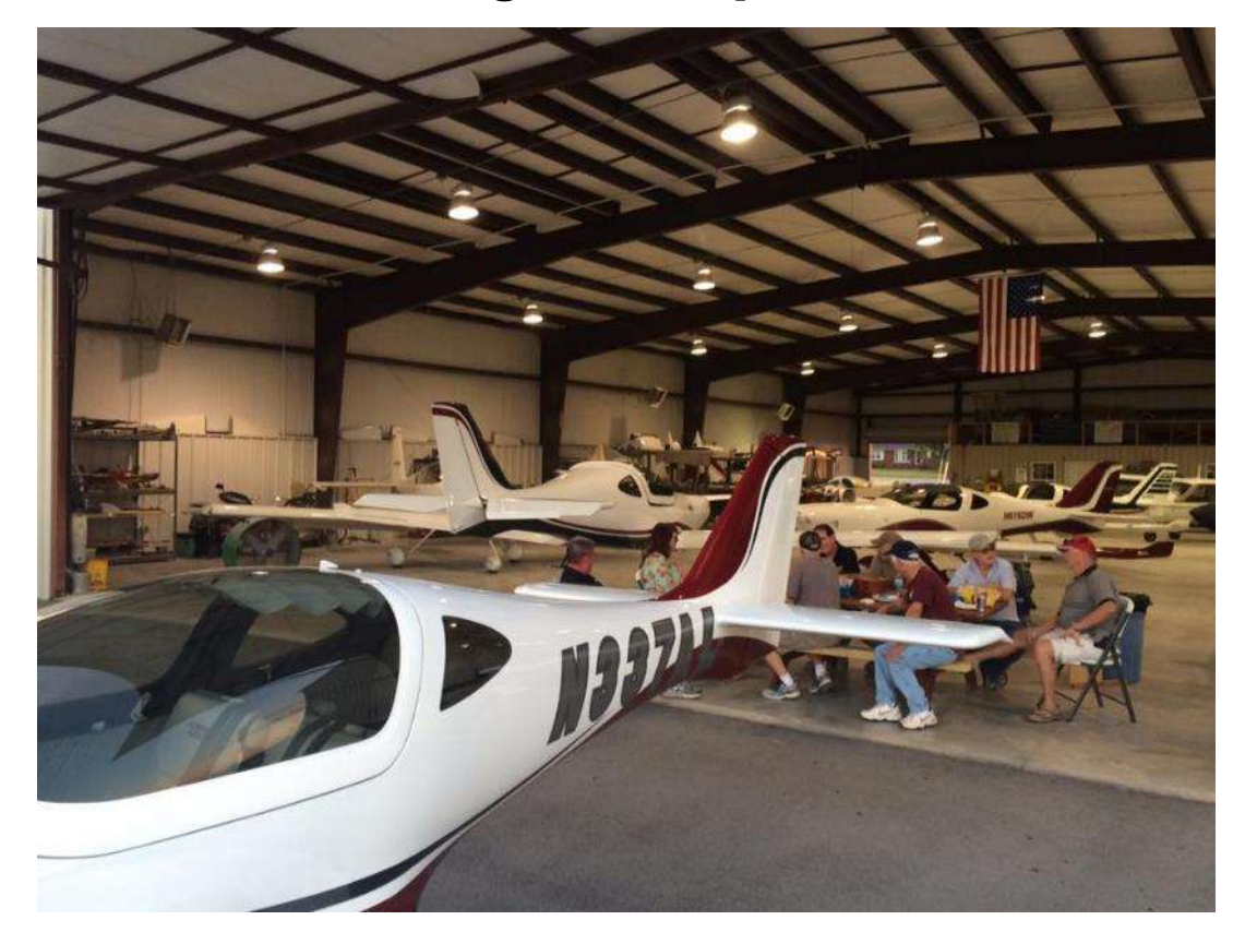
Just a Picture to Fill Up this Page