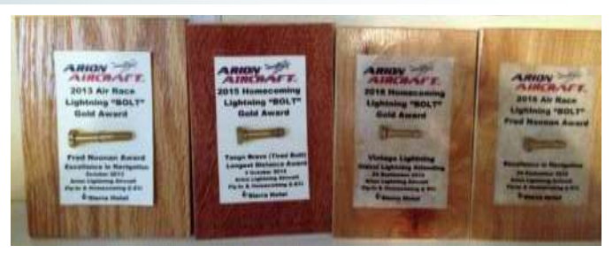
My Lightning Bolt Awards

As you can see, the awards are very prestigious and I keep mine on the shelf above my desk in my home office.