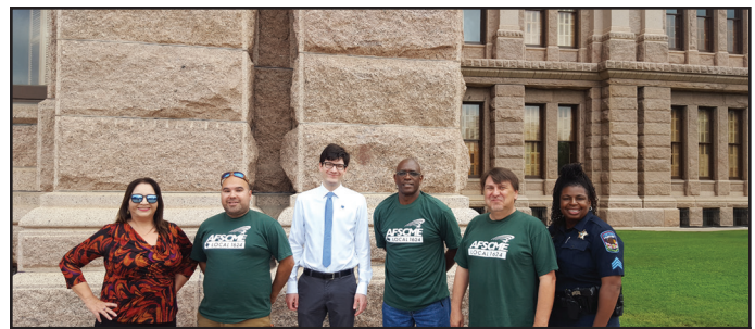
Local 1624 members and staff at the Texas Capitol.