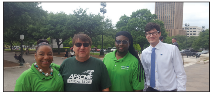
Local 1624 and 1550 members and staff at the Texas Capitol.

We were also joined by AFSCME Local 1550 out of Houston. Our message was well received by both state representatives and senators. It was very important for them to hear from the employees' perspective on the issues that matter most to their constituents. We want to thank everyone for taking time off of work to participate, especially Local 1550 for making the trip all the way from Houston.