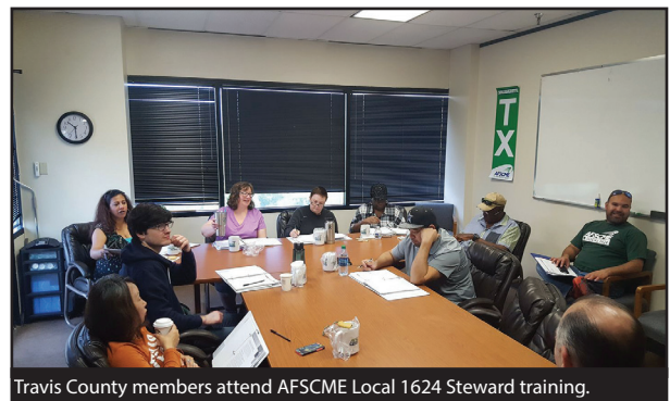
Travis County members attend AFSCME Local 1624 Steward training.

With a strong group of stewards, we can reach our full potential as a union that works together for the greater good of our membership. If you are interested in becoming a steward, please call our office for more information.