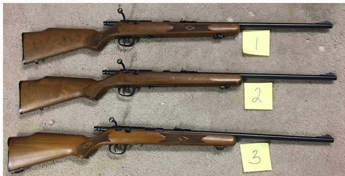
3 ea. Marlin Model 25N .22LR, iron sights. 1 magazine each. Condition good. Low mileage, but some surface rust that has been cleaned up and oiled. No pitting. Stocks clean.

The following long guns will be sold at live auction, at the February open meeting: