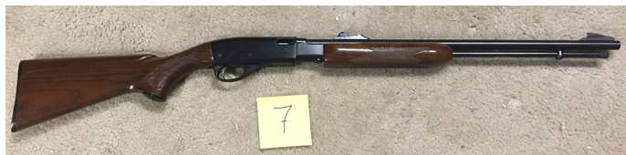
1 ea. Remington Model 572, .22S/L/LR, iron sights pump action. Condition fair: High mileage, some surface rust that has been cleaned up and oiled. Some wear on stock.