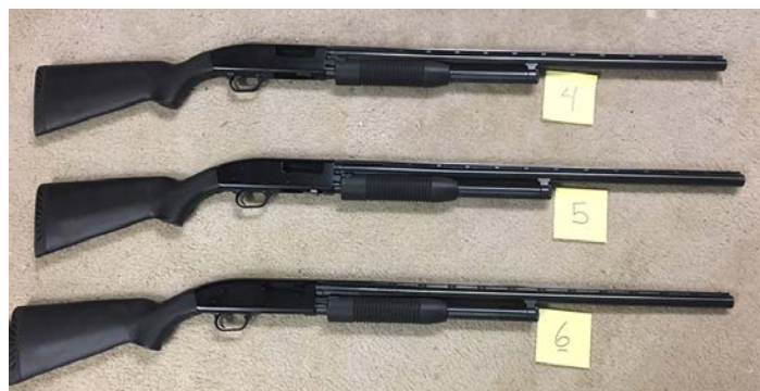
3 ea. Maverick Arms Model 88, 12Ga pump shotgun Condition good to excellent. Low mileage and clean.