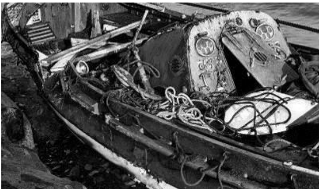
◀ The George Elmy found on the beach, 17 November 1962

The lifeboat capsized during a rescue off Seaham in November 1962 in which 5 volunteer crew members tragically lost their lives as well as 4 of 5 fishermen who had just been rescued.