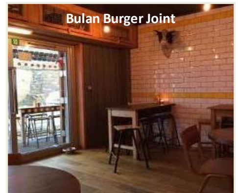
Bulan Burger Joint