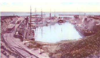
The North Dock, 1930

In recent years Durham County Council has worked with Seaham Harbour Dock Company, Friends of North Dock Seaham and the local community to bring about the regeneration of Seaham North Dock.