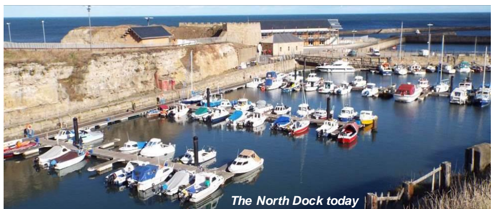
The North Dock today