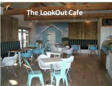
The LookOut Cafe