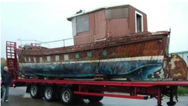
◀ Arriving at the docks before restoration

The lifeboat capsized during a rescue off Seaham in November 1962 in which 5 volunteer crew members tragically lost their lives as well as 4 of 5 fishermen who had just been rescued.