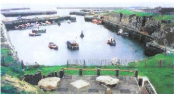
The North Dock, 1987