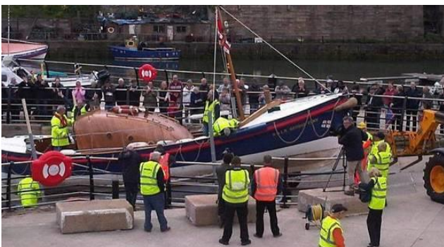
◀ Being lifted from the water ready to be housed in the Heritage Building, June 2013

The lifeboat was thought to have disappeared entirely after it had been removed from Seaham by the RNLI after the tragedy. However one of the members of the East Durham Heritage Group spotted the lifeboat for sale on eBay in 2009 and the money was raised to buy it and return it to Seaham.