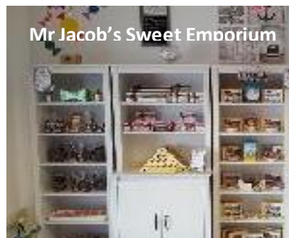
Mr Jacob's Sweet Emporium