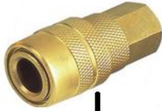
TWO LINES ON COUPLER