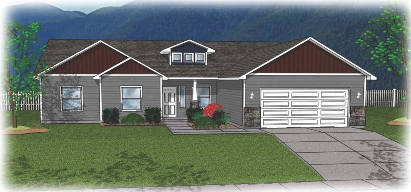
(Color combinations for brochure use only)

All measurements, dimensions and square footage are approximate and may vary. Prices may change without notice.