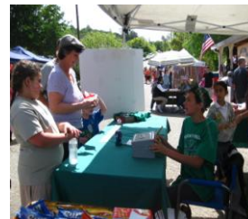
Smartsville 4-H booth

Our fifth annual Pioneer Day was another success. Supporting the community and the restoration work of the historic Catholic Church brings together a large, congenial group. If you attended last April 28 th , you were treated to tours to the Blue Point mine and Sucker Flat, Timbuctoo, and the church interior, There were fine craft and food vendors, stage entertainment, historic characters, informational booths and children's activities. Antique tractors, a firetruck, and engines were on display. Smartsville and Timbuctoo descendants visited and exchanged family stories. If you missed it this year, put it on your calendar for next year, and look for other community events SCRFI sponsors. Check out our webpage for updates.