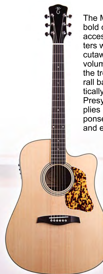
Model shown: LDC-45

The Missouri Cutaway delivers bold dreadnought tone with total access to the upper playing registers with an elegant Venetian cutaway. The slightly reduced body volume from the cutaway tightens the treble response for great overall balance whether played acoustically or amplified. The Fishman Presys Plus pickup system supplies excellent overall tonal response with absolute dependability and ease of use.