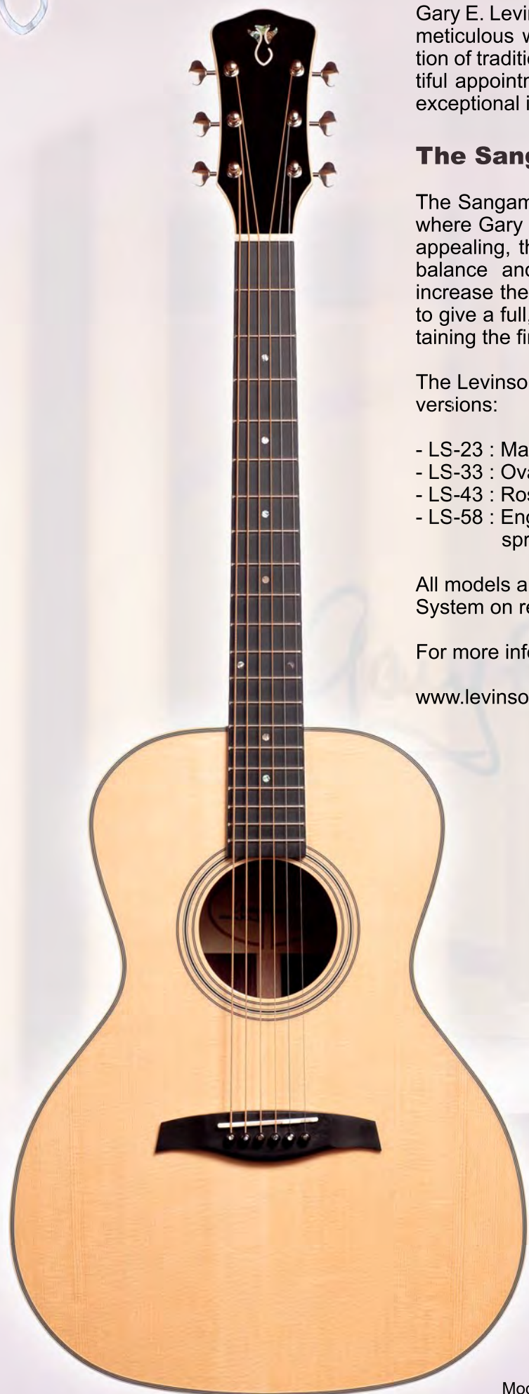
Model Shown: LS-23