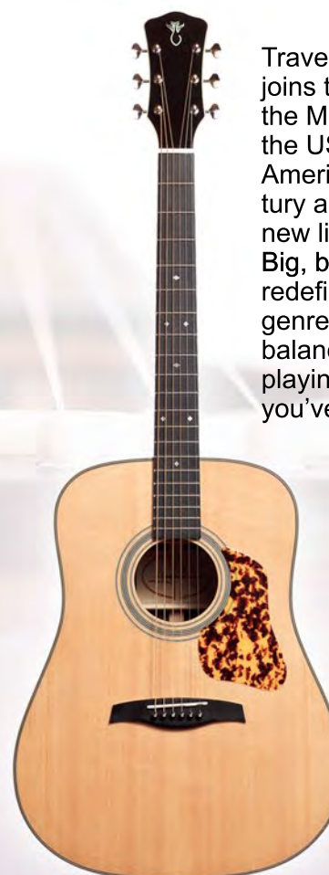
Model shown: LD-47

Traveling from Montana to where it joins the Mississippi near St. Louis, the Missouri is the longest river in the US. The Missouri defined the American frontier in the 19th century and its name now defines my new line of dreadnought guitars. Big, bold, beautiful instruments that redefine the powerful sound of this genre of guitars with amazing tonal balance and rapid response to all playing styles unlike anything you've played before.