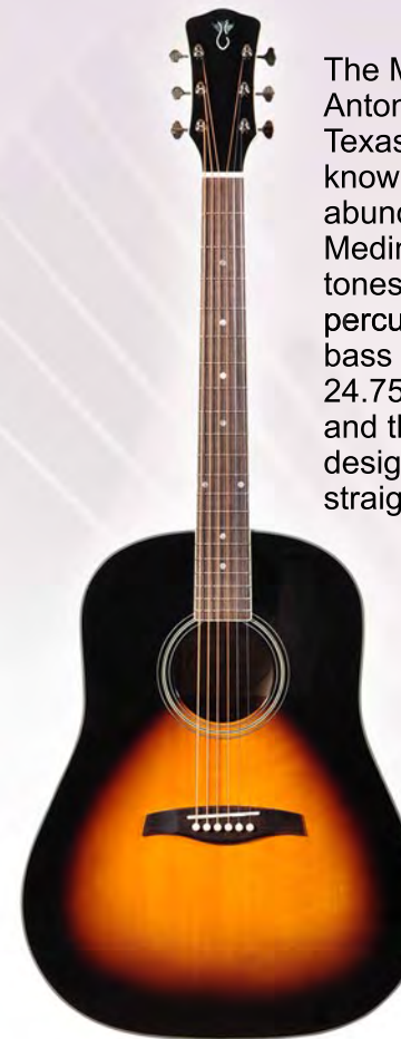
Model shown: LJ-24VS

The Medina River runs near San Antonio, Texas in the heart of the Texas Hill Country. Its shores are known for lush vegetation and abundant wildlife. The Levinson Medina brings you lush warm tones and abundant volume with a percussive sound and controlled bass response resulting from the 24.75 inch (628 mm) scale length and the round-shoulder body design. A perfect pleasure to play – straight from the heart.