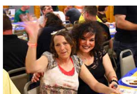
Folks - if you don't come to the banquet you not only miss out on voting for officers but also a really good time! Great people, great food and lots of laughter and music make a point to get to the next one!

A few more from the annual DDA May Banquet