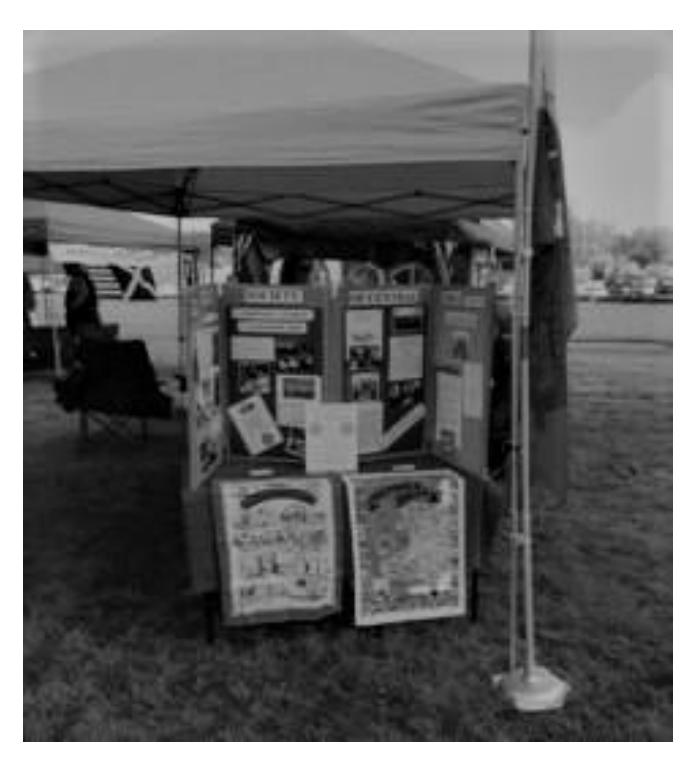
Booth setup at Beltane Festival

Highland Games are held throughout the year in Scotland and other countries as a way of celebrating Scottish and Celtic culture and heritage.