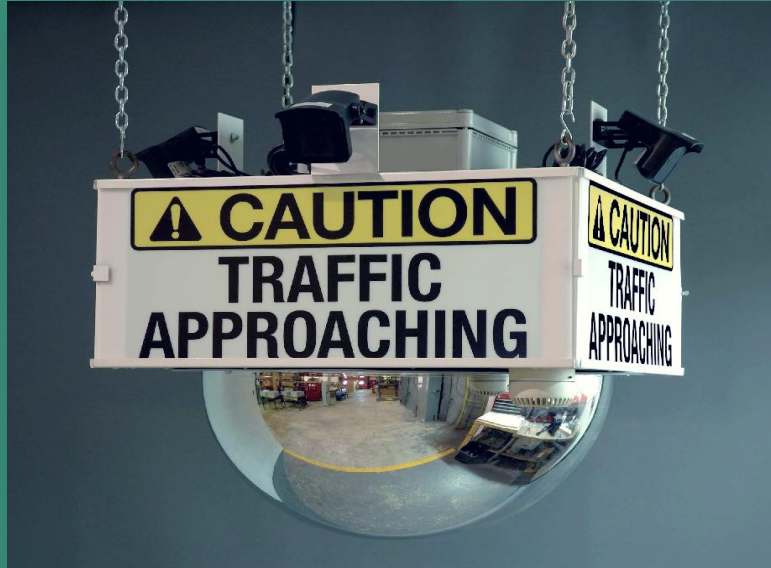
INTERSECTION CAUTION 3 WAY SYSTEM (Shown)