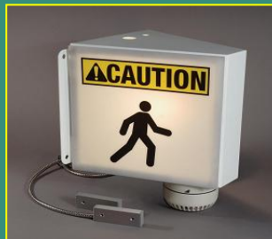
2-Sided Pedestrian with Magnetic Sensor