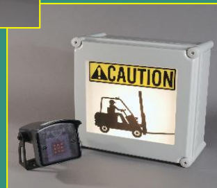
Type 12/13 Fork Truck Alert