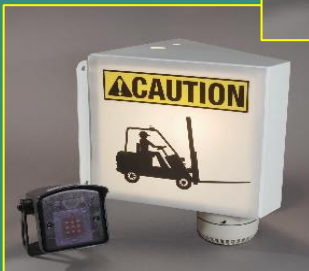
2-Sided Fork Truck Traffic Caution