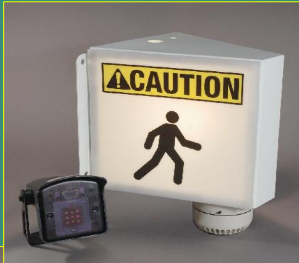
2-Sided Pedestrian Caution Wall Mounted unit for Doorways